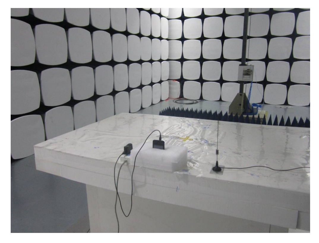
Radiated Spurious Emissions Test Setup Above 1GHz -Front View