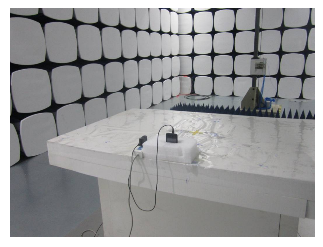
Radiated Spurious Emissions Test Setup Above 1GHz -Front View