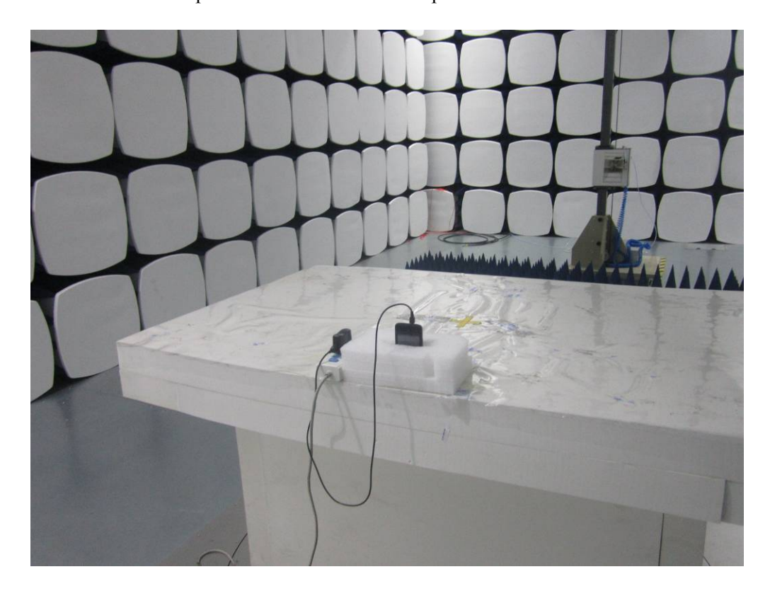
Radiated Spurious Emissions Test Setup Above 1GHz -Front View