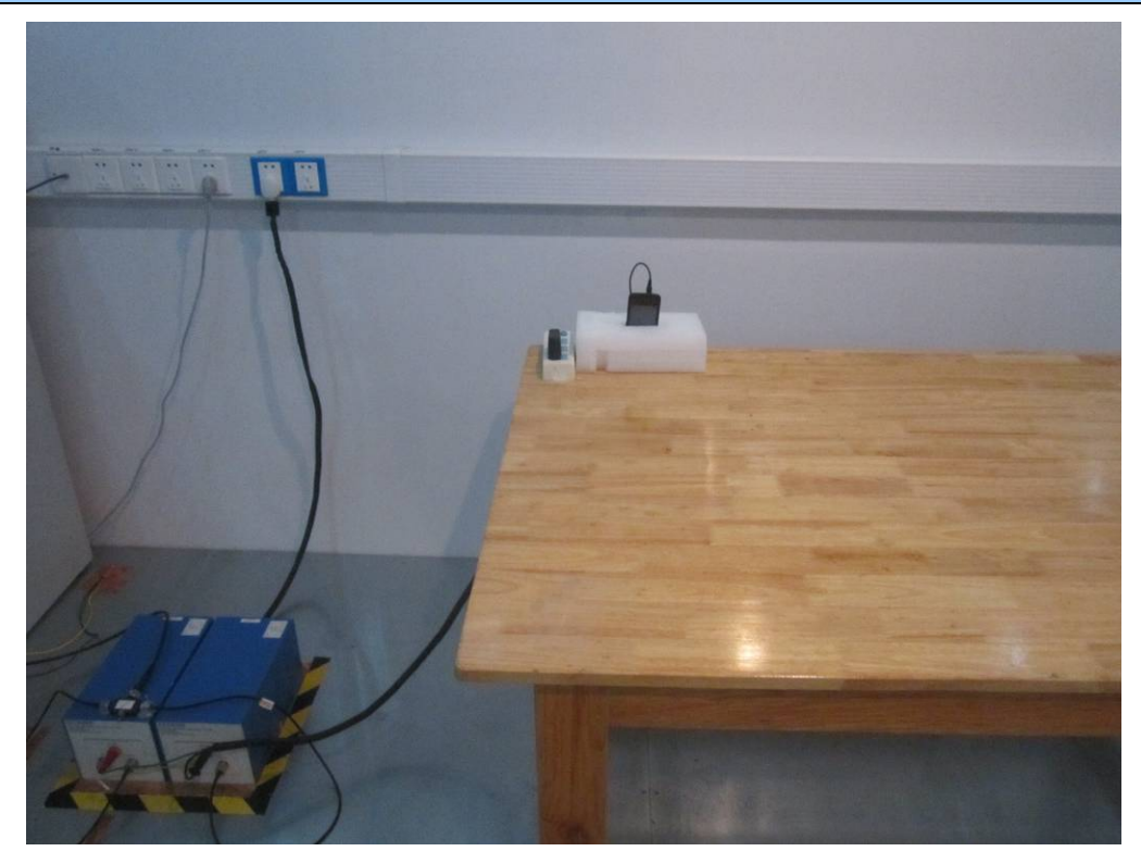
Conducted Emissions Test Setup Front View