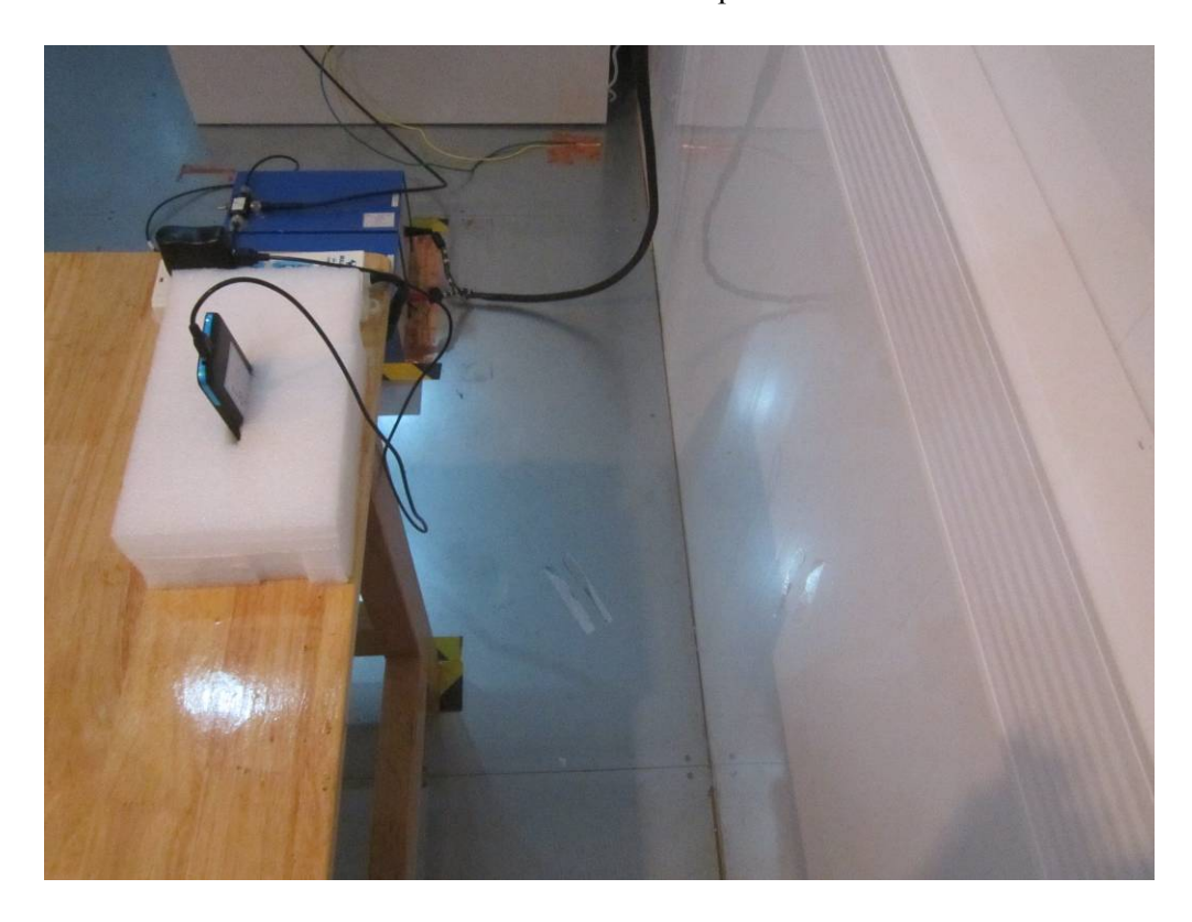
Conducted Emissions Test Setup Side View