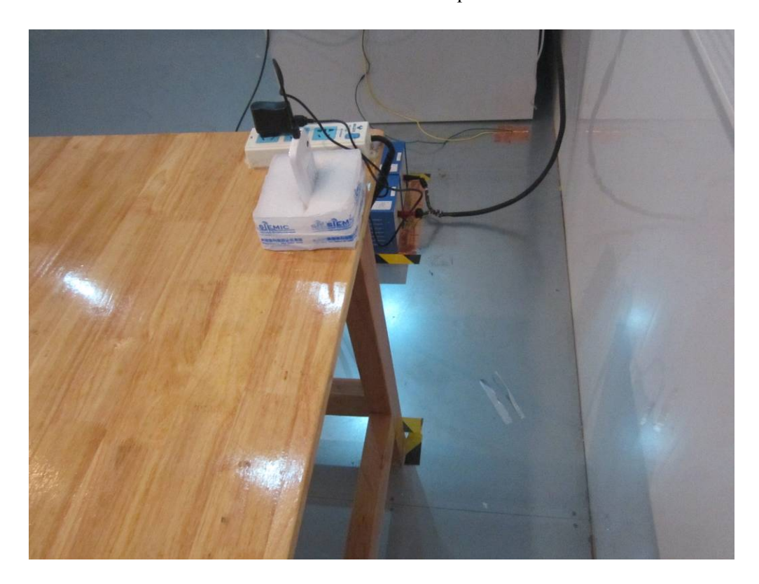
Conducted Emissions Test Setup Side View