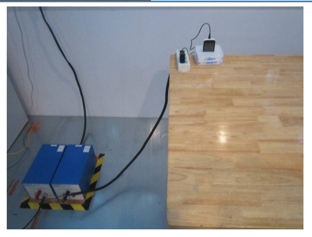
Conducted Emissions Test Setup Front View