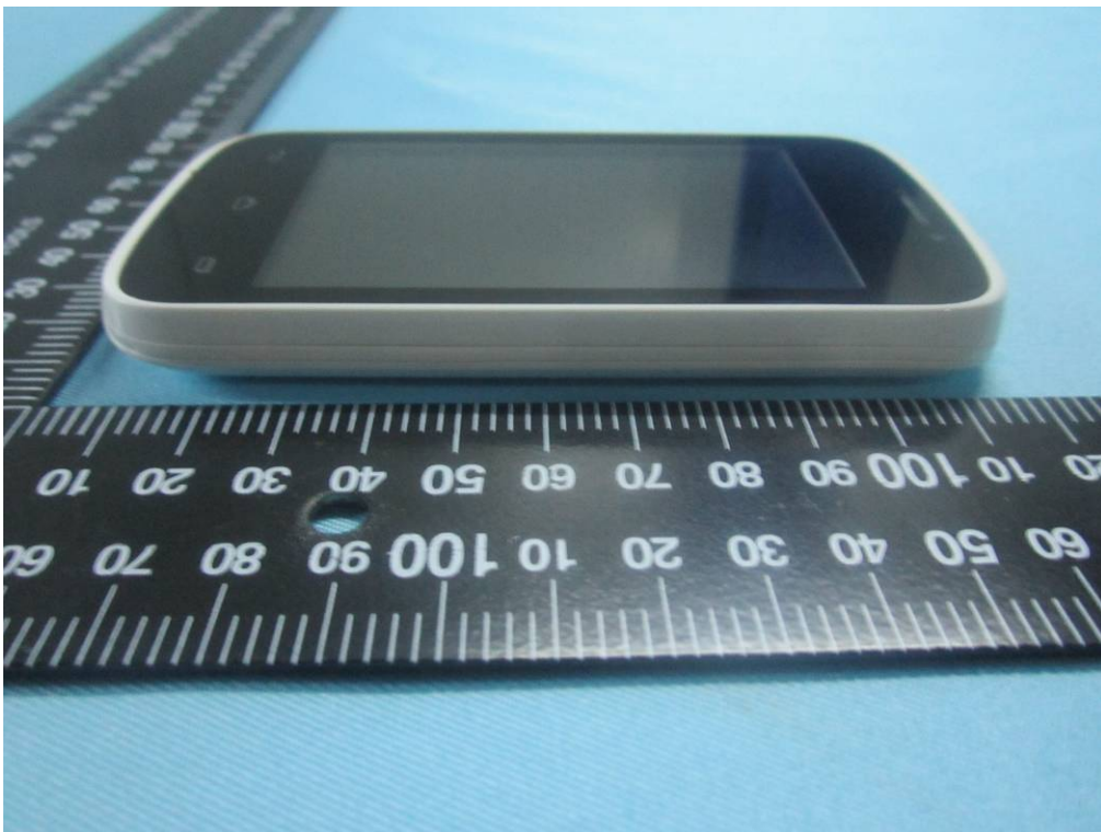
EUT - Right View