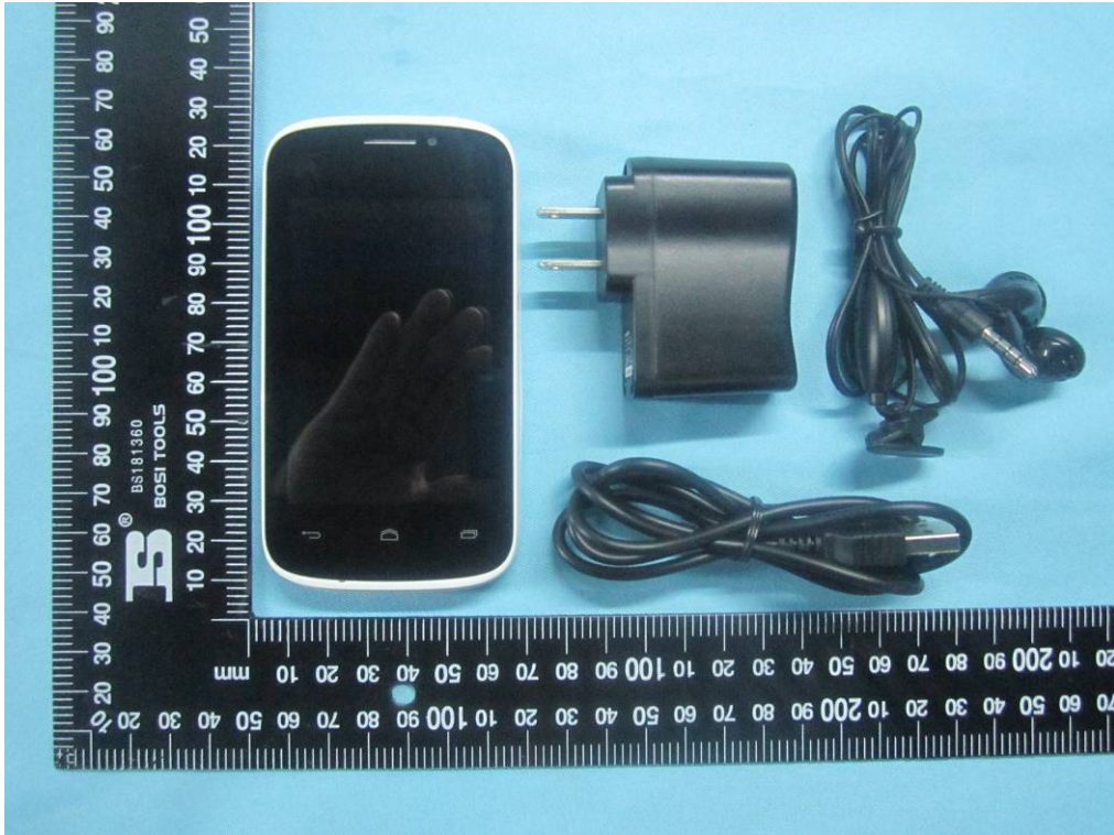
Whole Package - Top View