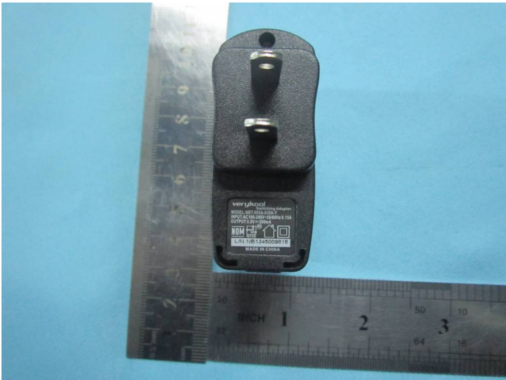
Adapter - Top View