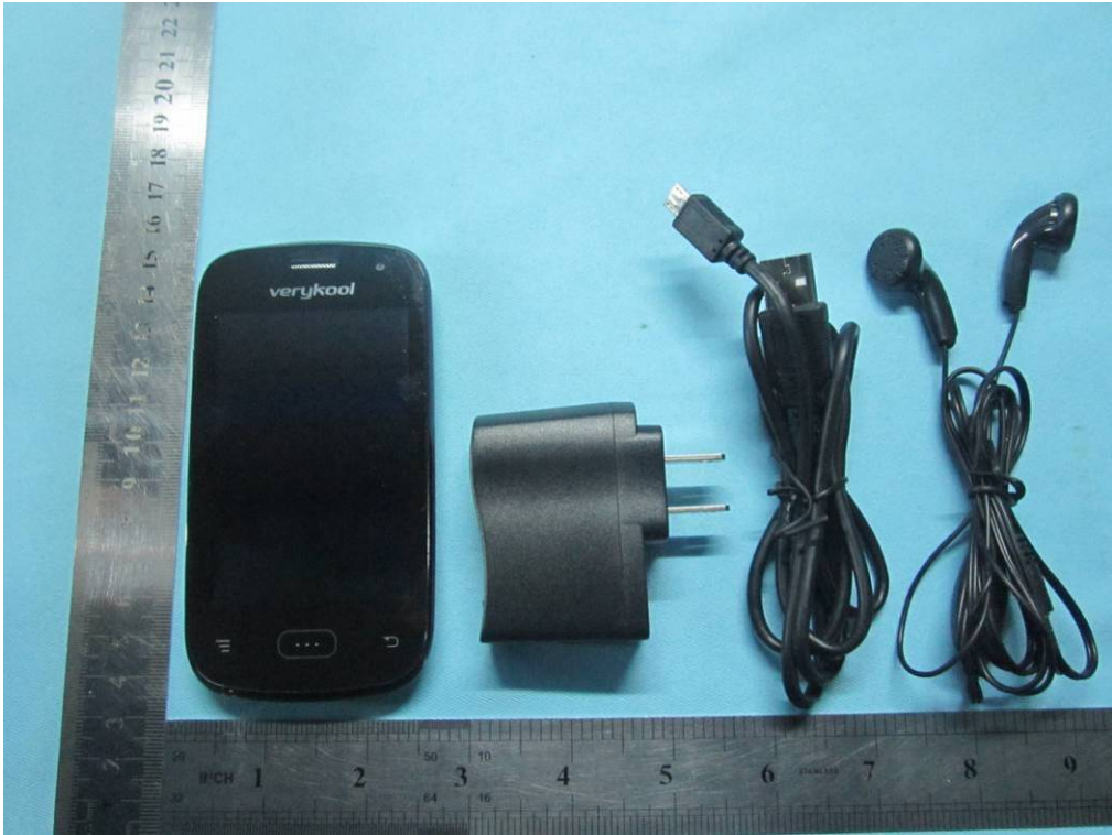
Whole Package - Top View