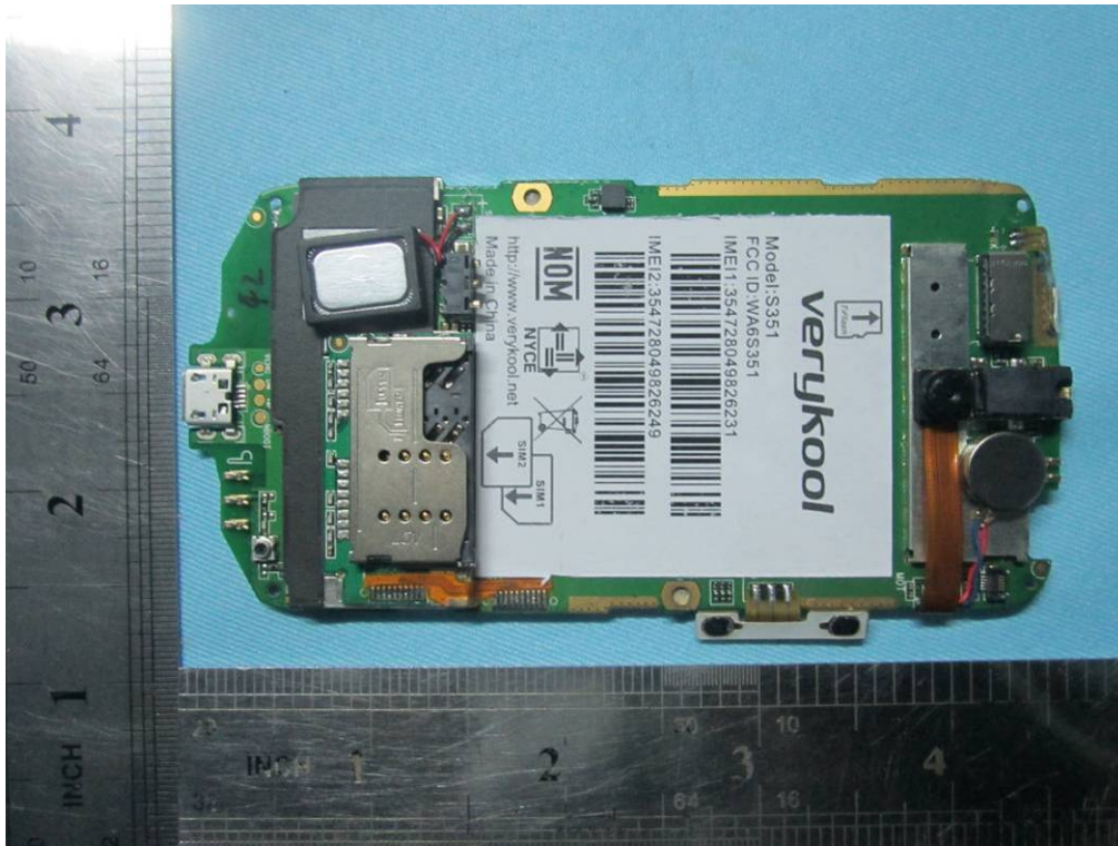
Mainboard With Shielding - Front View