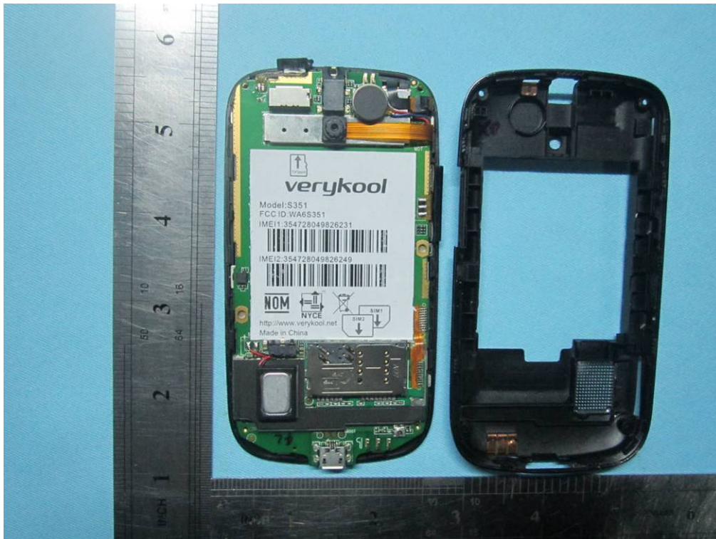
Cover Off - Top View 2