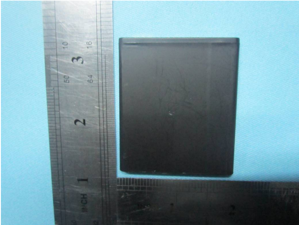
Battery - Top View

Report No.: 13070565-FCC-E1 Issue Date: December 25, 2013 Page: 24 of 35 www.siemic.com.cn