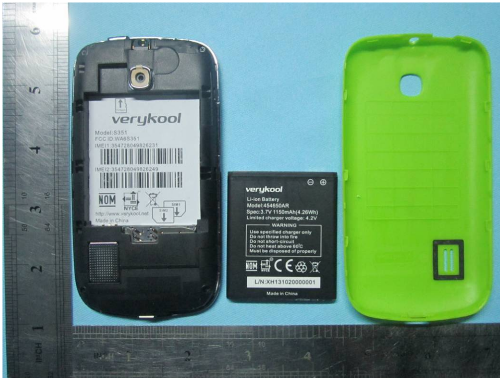
Cover Off - Top View 1