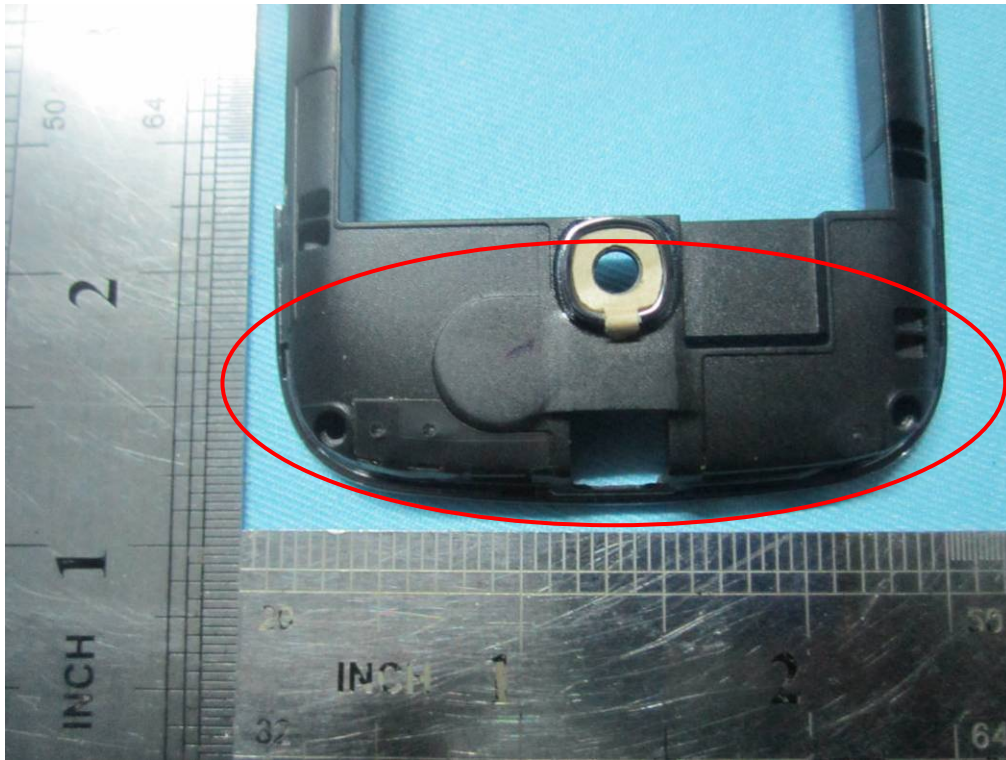
Bluetooth / WIFI Antenna View