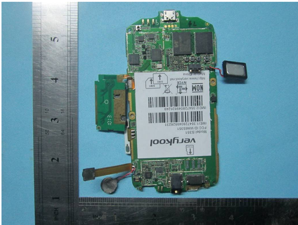
Mainboard Without Shielding - Front View