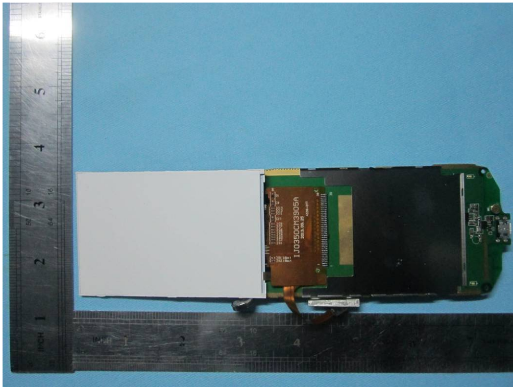
Mainboard Without Shielding – Rear View