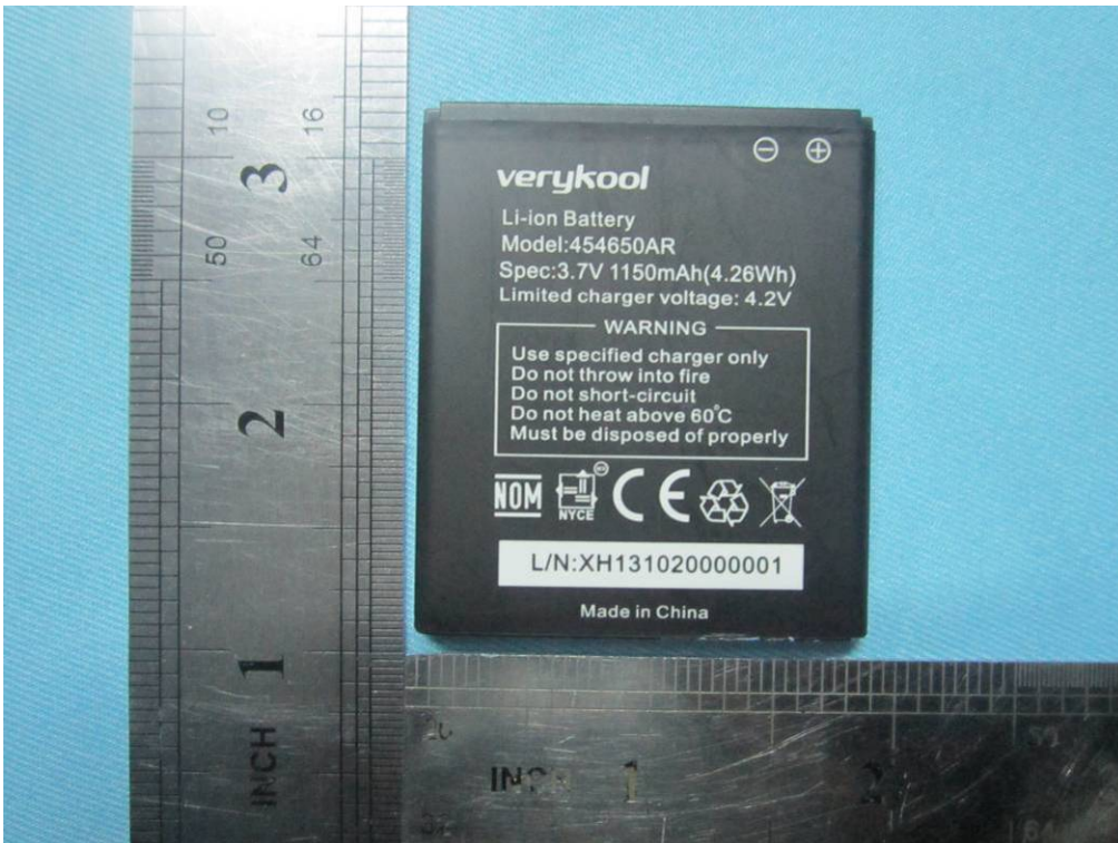
Battery - Bottom View