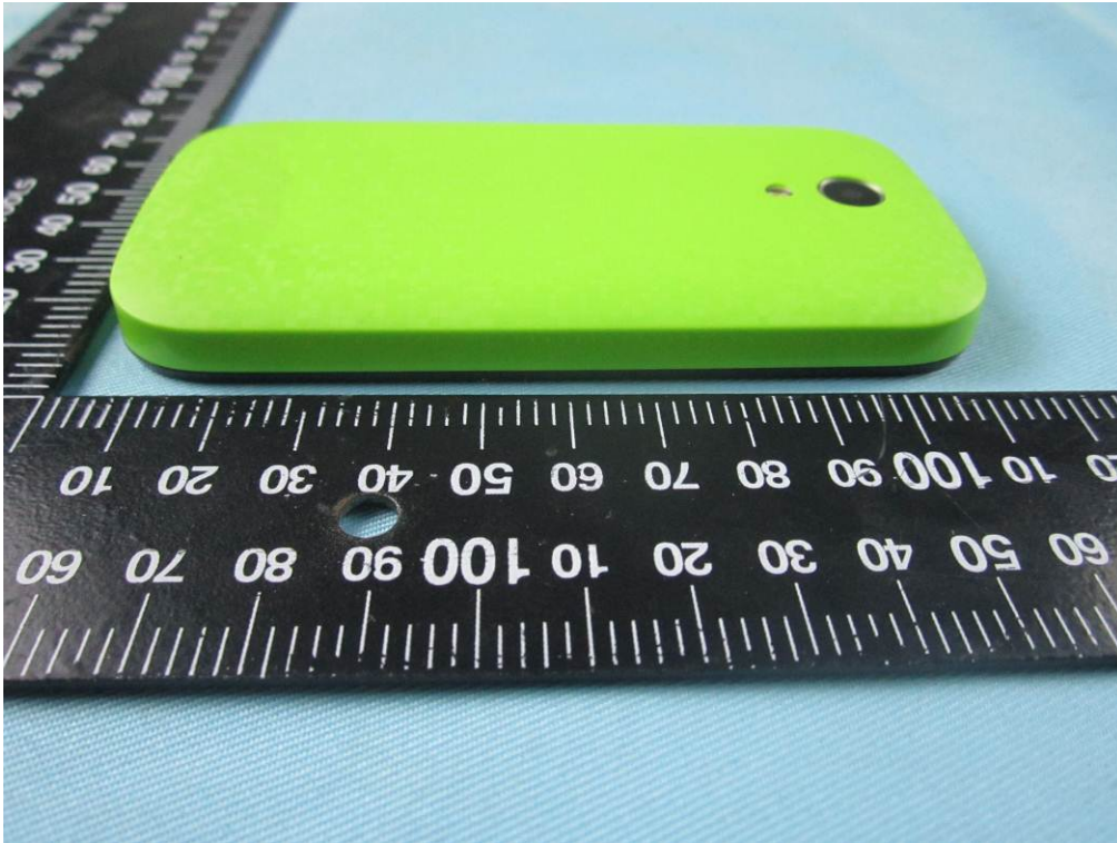
EUT - Top View

Report No.: 14070551-FCC Issue Date: October 09, 2014 Page: 3 of 9 www.siemic.com www.siemic.com.cn