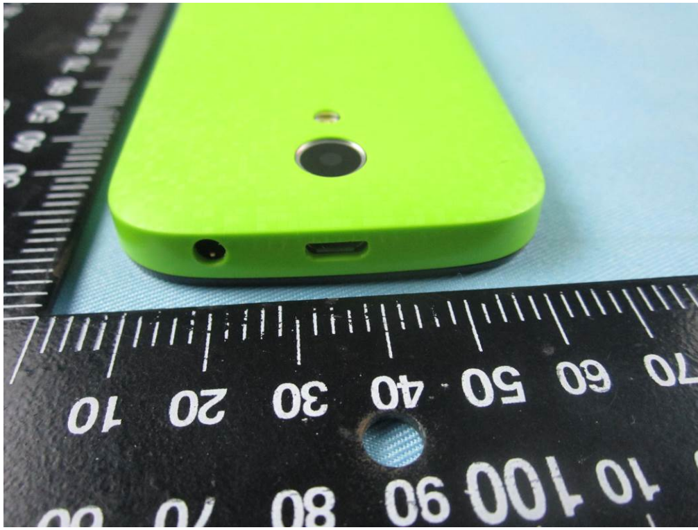
EUT - Left View

Report No.: 14070551-FCC Issue Date: October 09, 2014 Page: 4 of 9 www.siemic.com www.siemic.com.cn