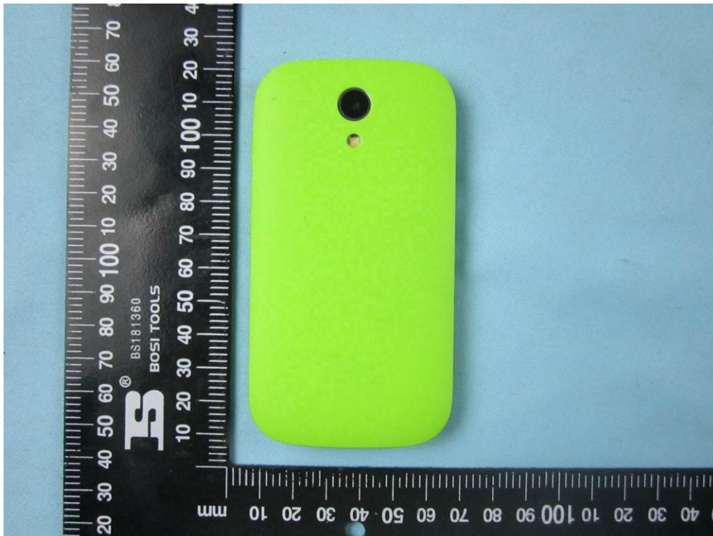
EUT - Rear View