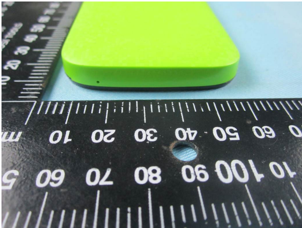
EUT - Right View