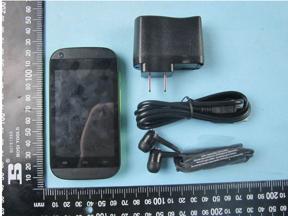
Whole Package - Top View