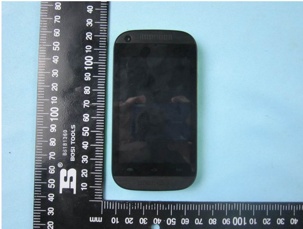
EUT - Front View

Report No.: 14070551-FCC Issue Date: October 09, 2014 Page: 2 of 9 www.siemic.com www.siemic.com.cn