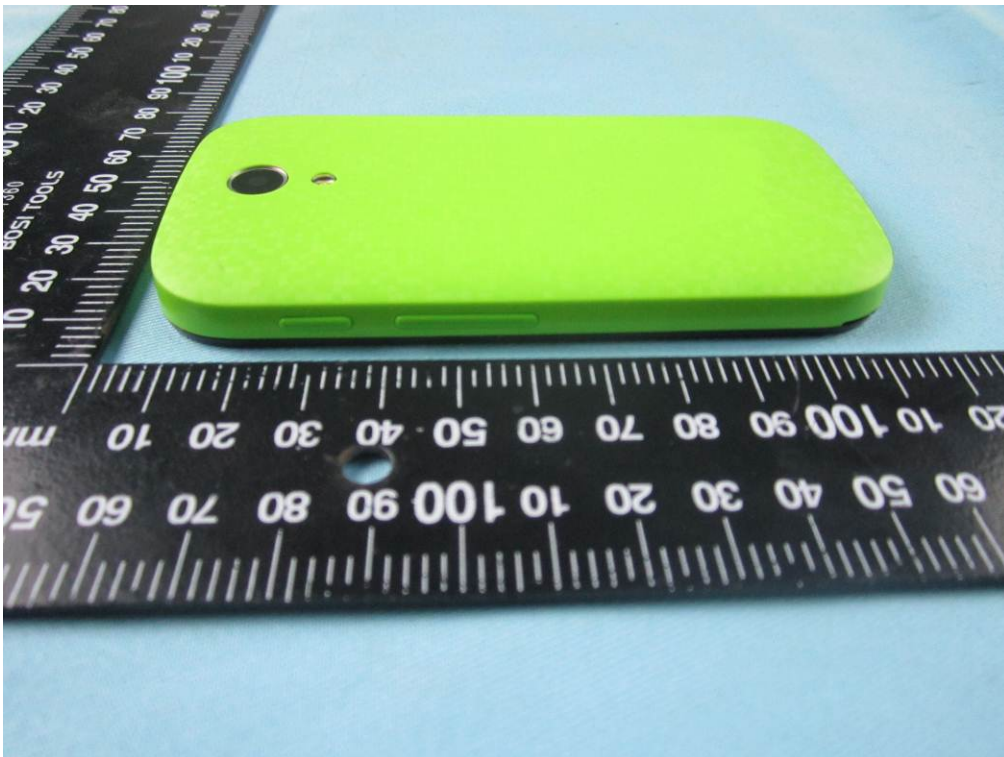
EUT - Bottom View