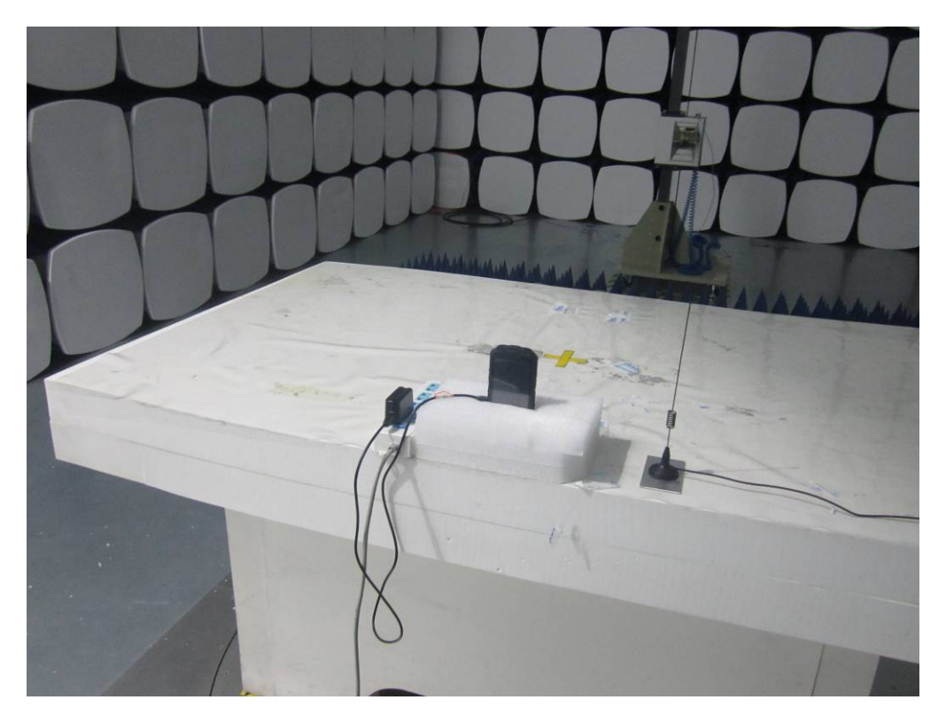
Radiated Spurious Emissions Test Setup Above 1GHz -Front View