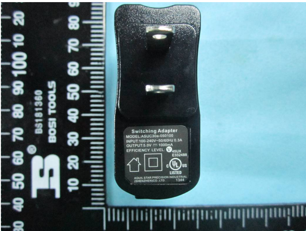
Adapter - Front View