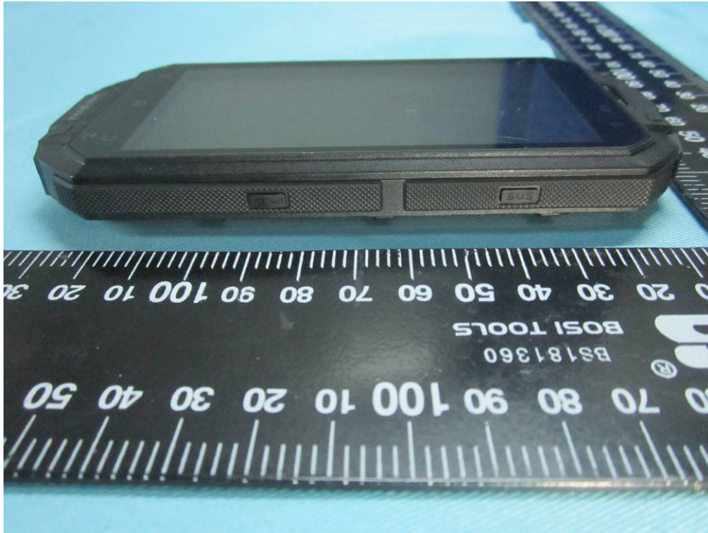
EUT - Left View

Report No.: 14070321-FCC-E1 Issue Date: August 05, 2014 Page: 22 of 38 www.siemic.com www.siemic.com.cn