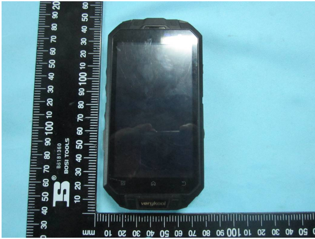
EUT - Front View

Report No.: 14070321-FCC-E1 Issue Date: August 05, 2014 Page: 20 of 38 www.siemic.com www.siemic.com.cn