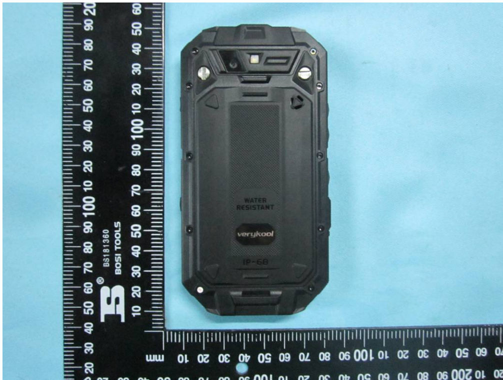
EUT - Rear View