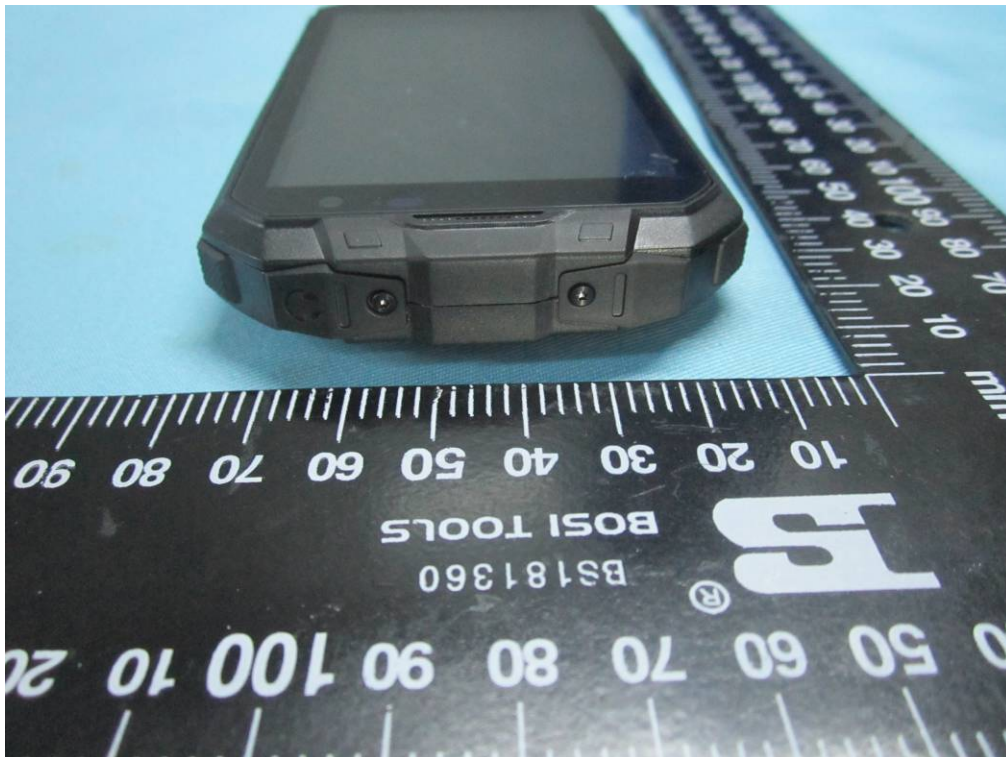
EUT - Bottom View