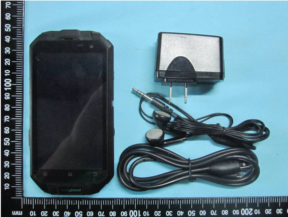
Whole Package - Top View