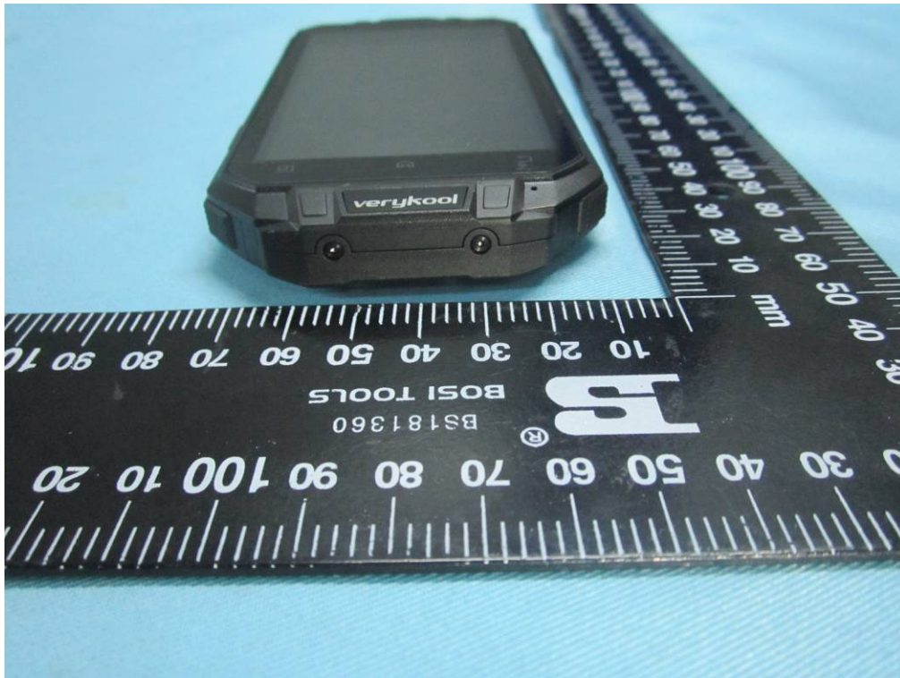
EUT - Top View

Report No.: 14070321-FCC-E1 Issue Date: August 05, 2014 Page: 21 of 38 www.siemic.com www.siemic.com.cn