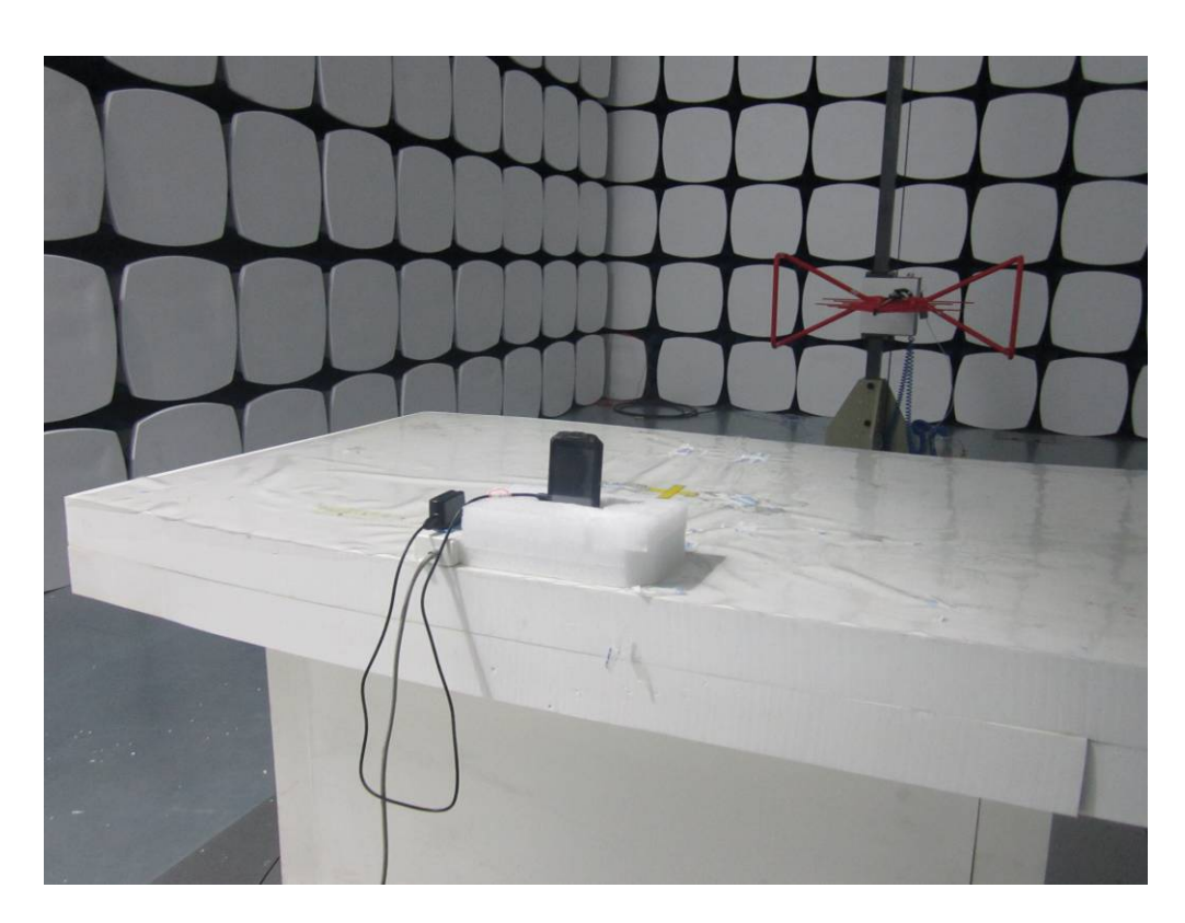
Radiated Spurious Emissions Test Setup Below 1GHz - Front View

Report No.: 14070321-FCC-R3 Issue Date: August 05, 2014 Page: 67 of 73 www.siemic.com