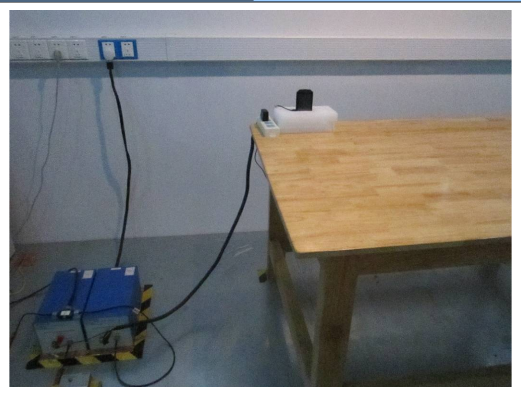
Conducted Emissions Test Setup Front View