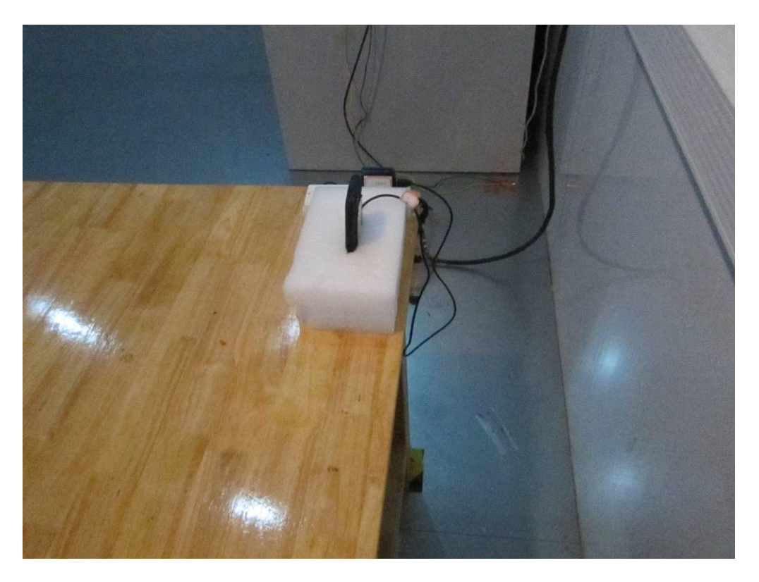
Conducted Emissions Test Setup Side View