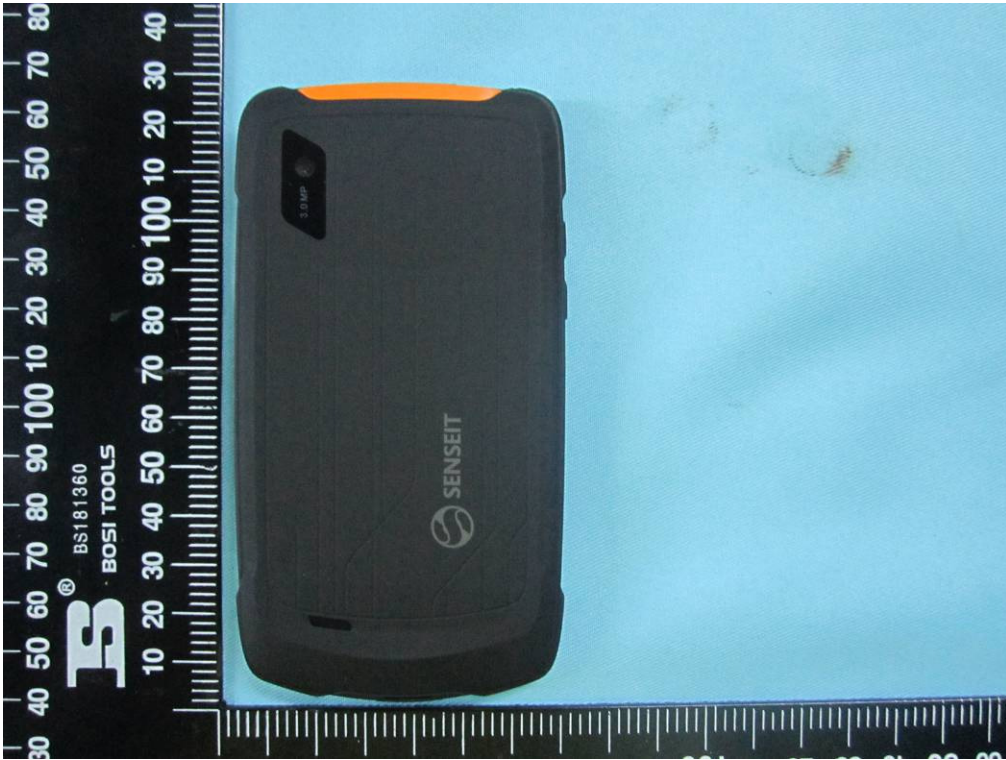
EUT - Rear View