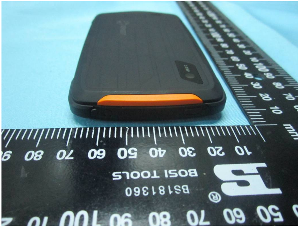
EUT - Top View

Report No.: 14070287-FCC-E1 Issue Date: June 25, 2014 Page: 21 of 37 www.siemic.com www.siemic.com.cn