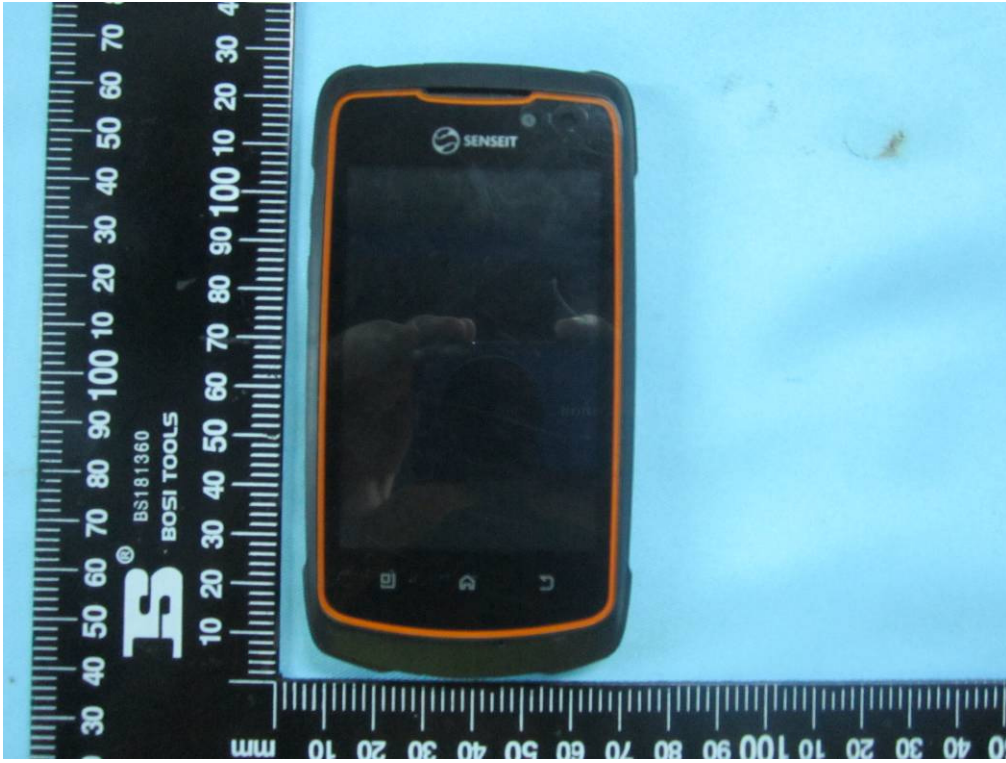
EUT - Front View