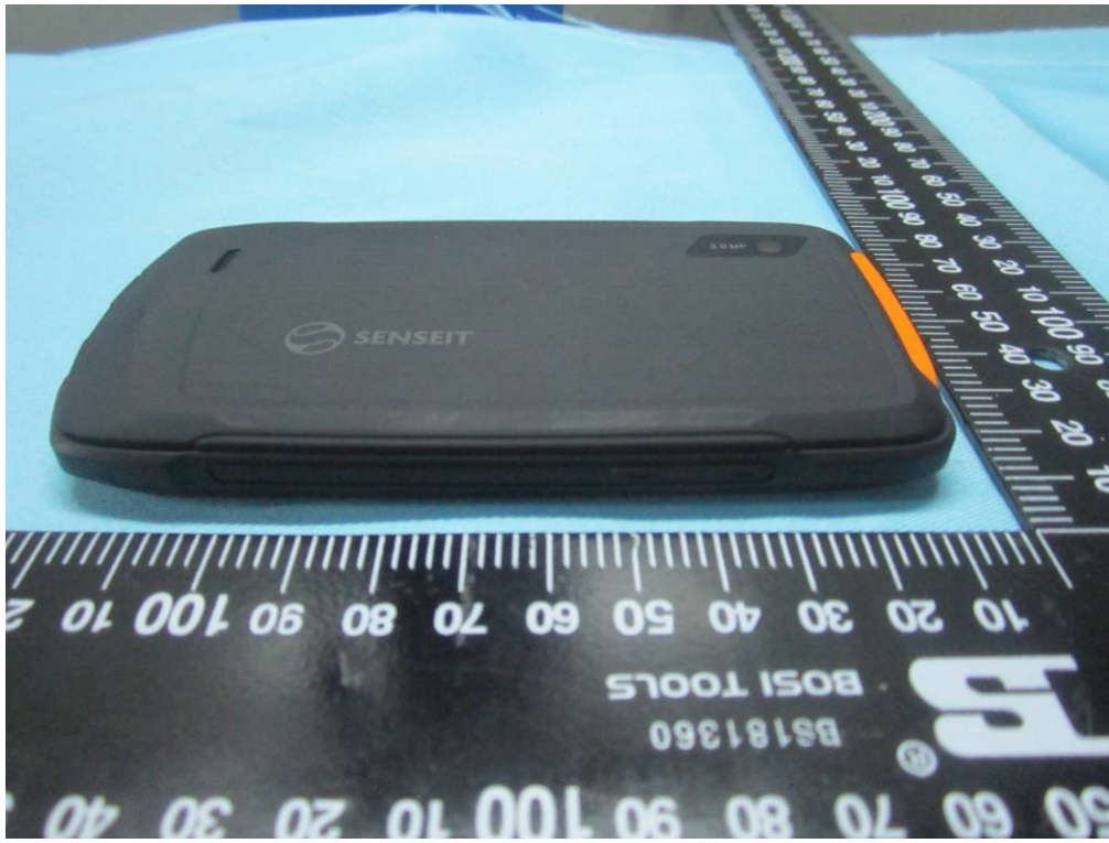
EUT - Left View

Report No.: 14070287-FCC-E1 Issue Date: June 25, 2014 Page: 22 of 37 www.siemic.com www.siemic.com.cn