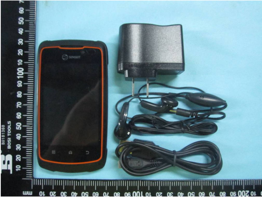
Whole Package - Top View