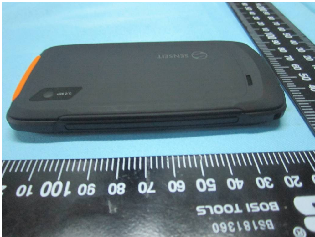
EUT - Right View