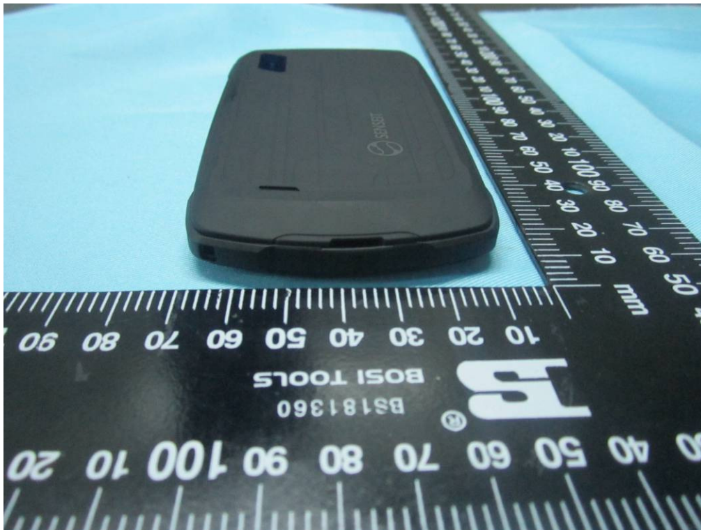
EUT - Bottom View