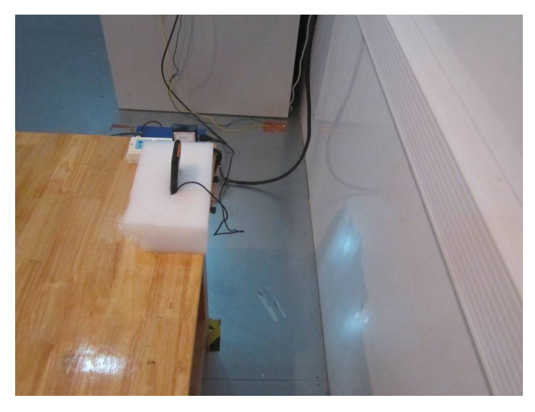
Conducted Emissions Test Setup Side View