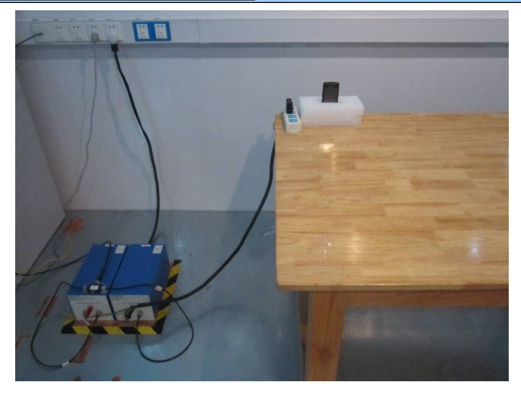
Conducted Emissions Test Setup Front View