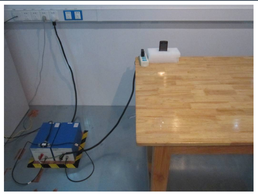
Conducted Emissions Test Setup Front View

Annex B.iii. Photograph 3: Test Setup Photo