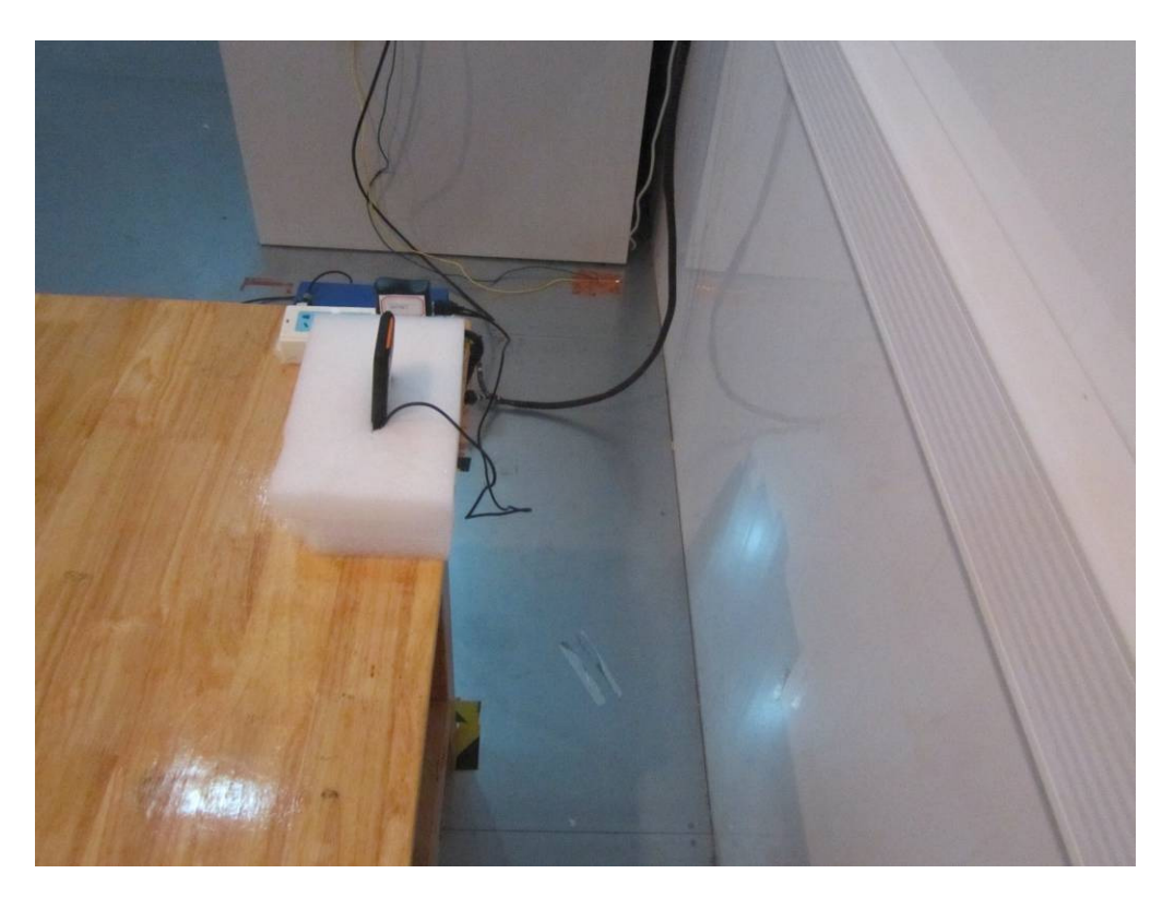
Conducted Emissions Test Setup Side View