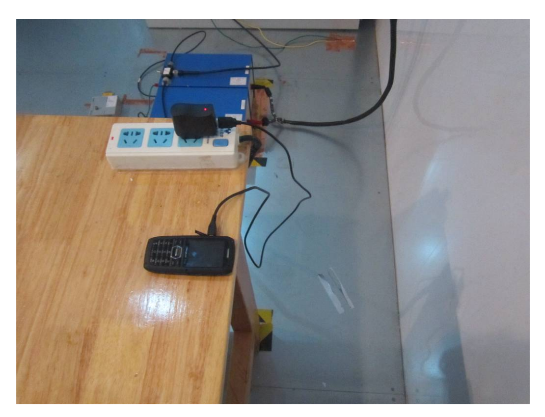
Conducted Emissions Test Setup Side View

Conducted Emissions Test Setup Front View