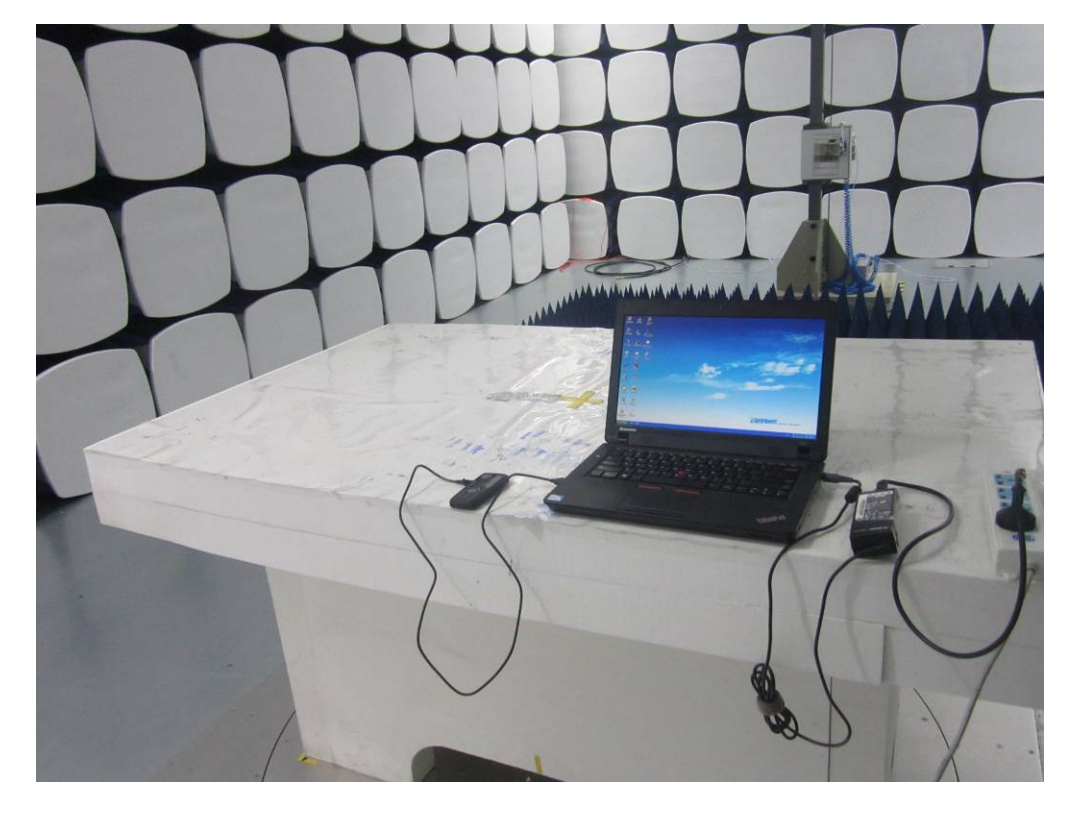
Radiated Spurious Emissions Test Setup Above 1GHz -Front View