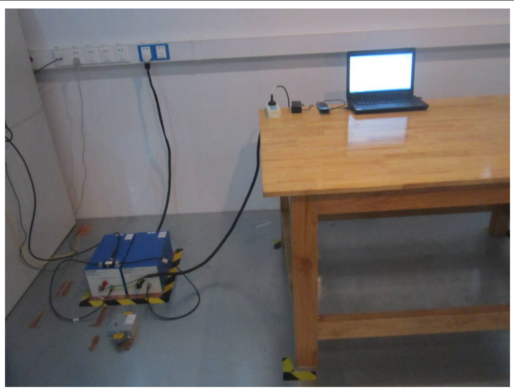
Conducted Emissions Test Setup Front View