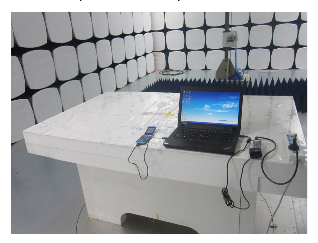
Radiated Spurious Emissions Test Setup Above 1GHz -Front View