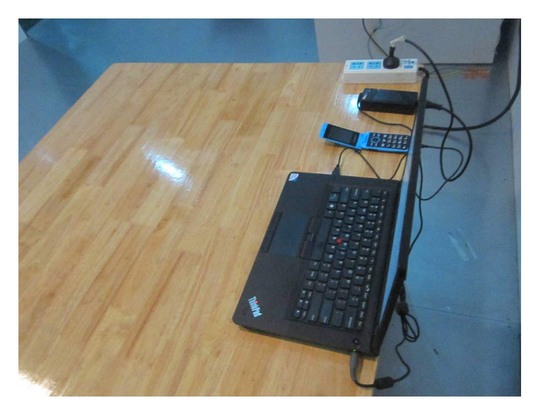
Conducted Emissions Test Setup Side View