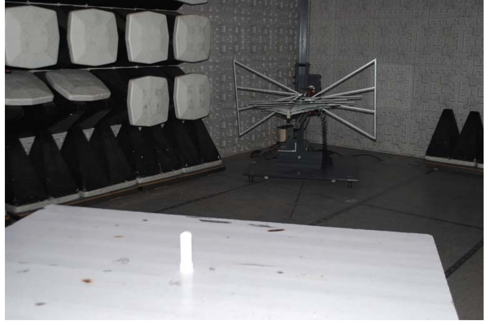
The Field Strength of Radiation Emission (Above 1GHz)