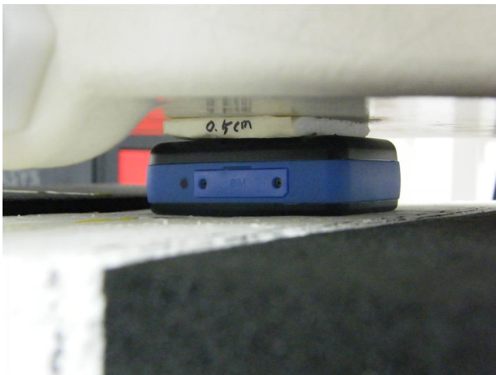
<REAR FACING PHANTOM>