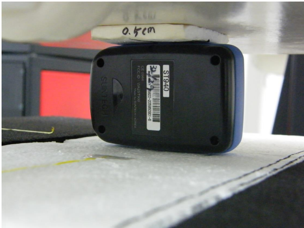
<LEFT FACING PHANTOM>