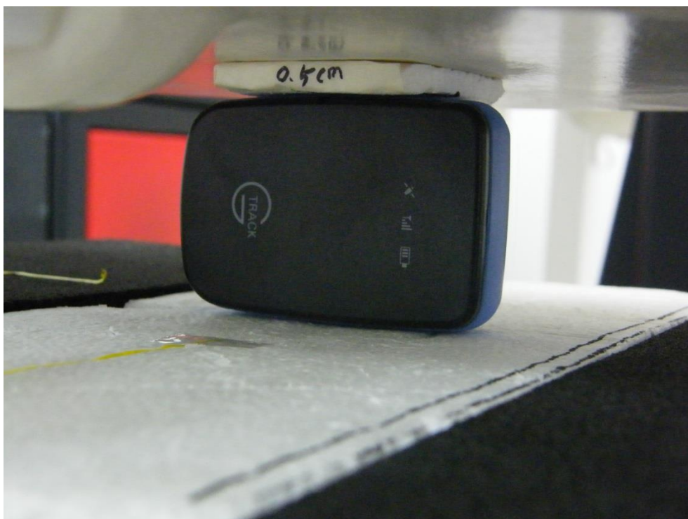
<RIGHT FACING PHANTOM>