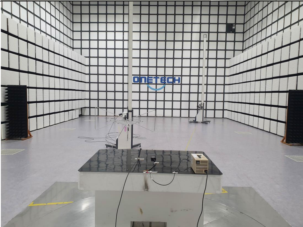
30 MHz ~1 GHz