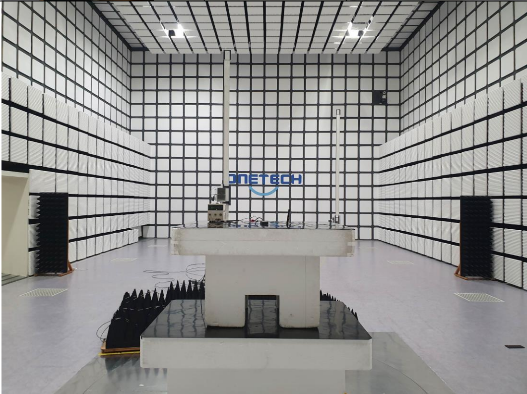
1 GHz ~ 6 GHz