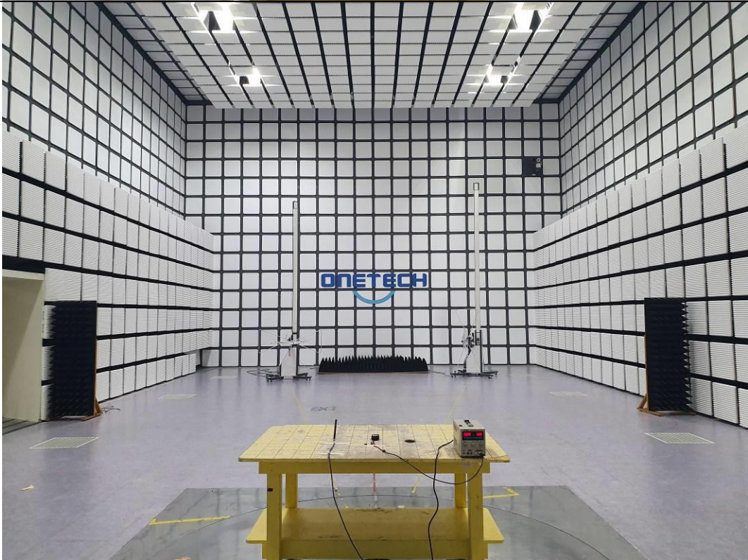
30 MHz ~1 GHz