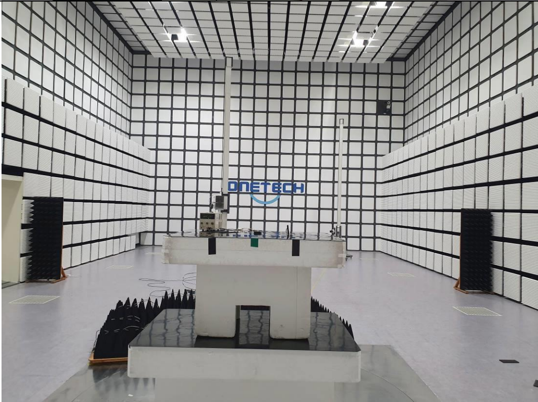
1 GHz ~ 6 GHz