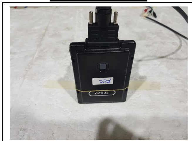
EUT Position: Z-axis