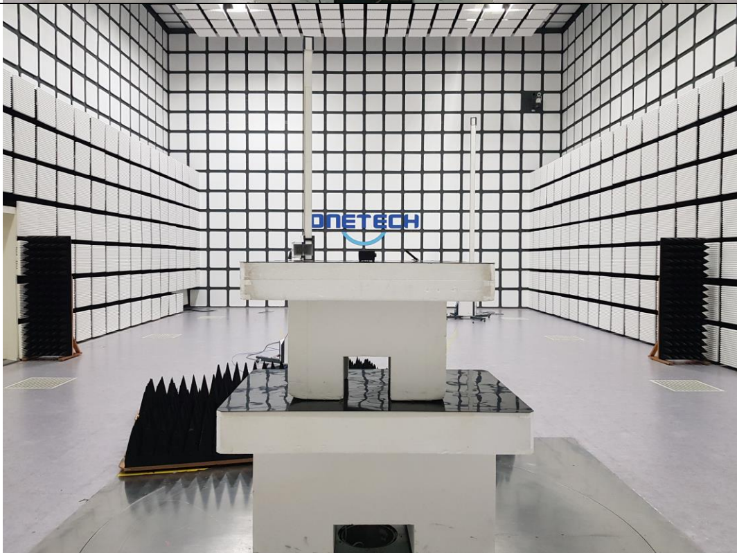
1 GHz ~ 6 GHz