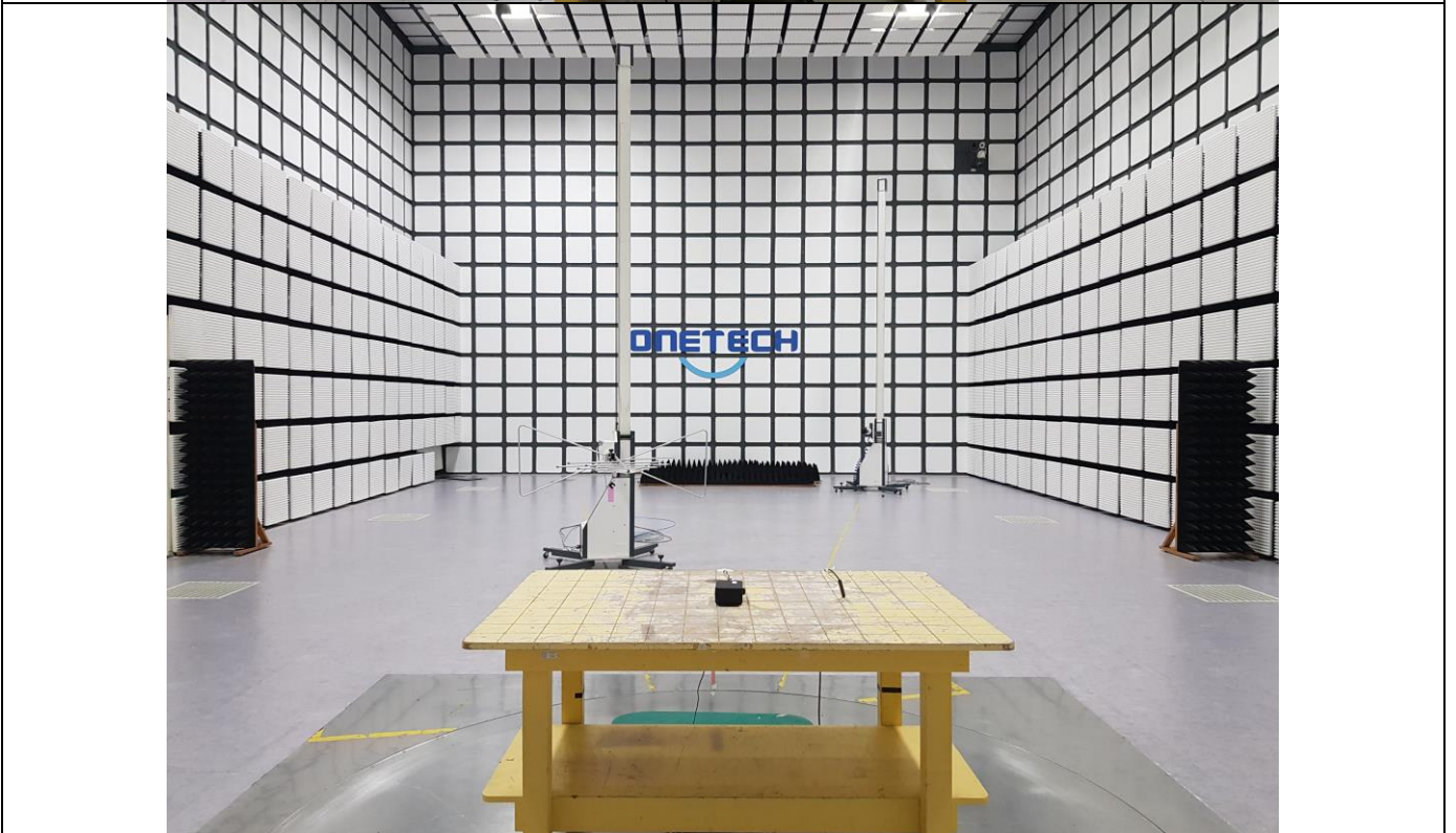
30 MHz ~1 GHz