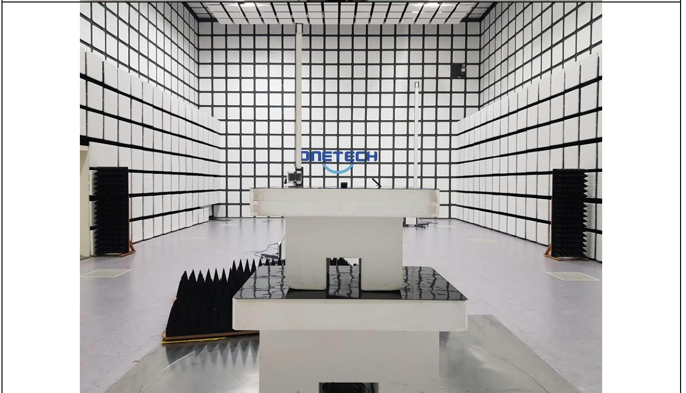
1 GHz ~ 6 GHz