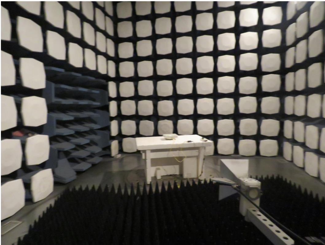
Radiated Spurious Emissions Test setup