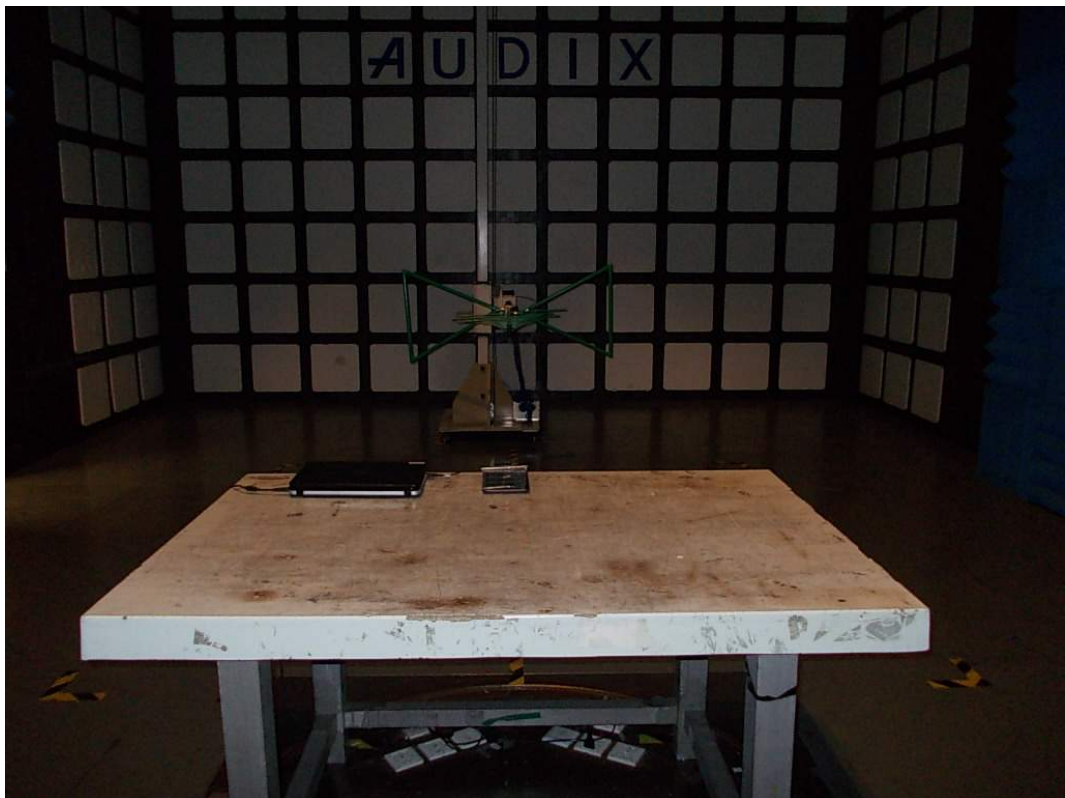
BACK VIEW OF RADIATED EMISSION TEST ( > 30\text{MHz} )