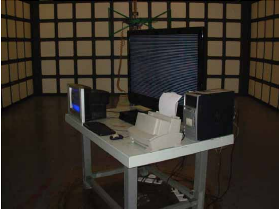
SETUP WITH MAXIMUM DETECTED EMISSION AT HORIZONTAL POLARIZATION (D-SUB 1920*1080@60Hz)