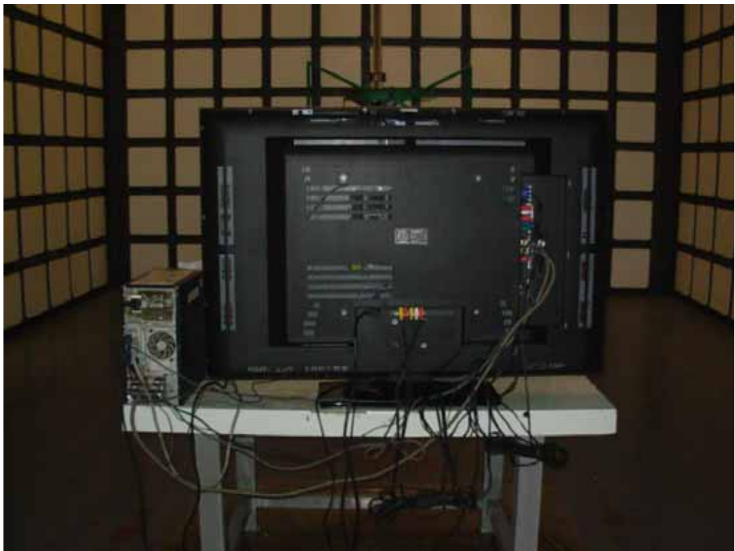
BACK VIEW OF RADIATED EMISSION TEST