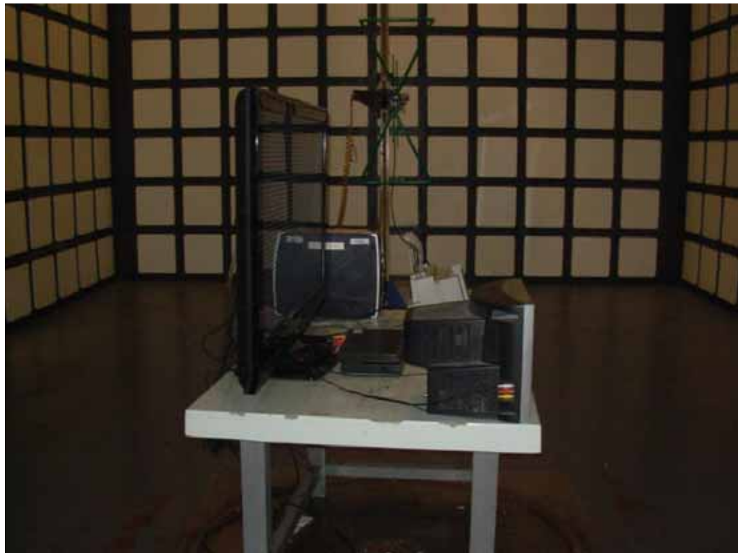
SETUP WITH MAXIMUM DETECTED EMISSION AT VERTICAL POLARIZATION (D-SUB 1920*1080@60Hz)