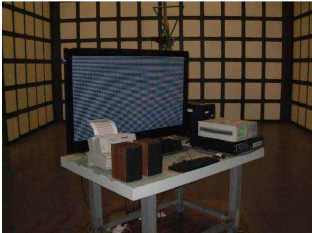
SETUP WITH MAXIMUM DETECTED EMISSION AT VERTICAL POLARIZATION (D-SUB 800*600@60Hz)