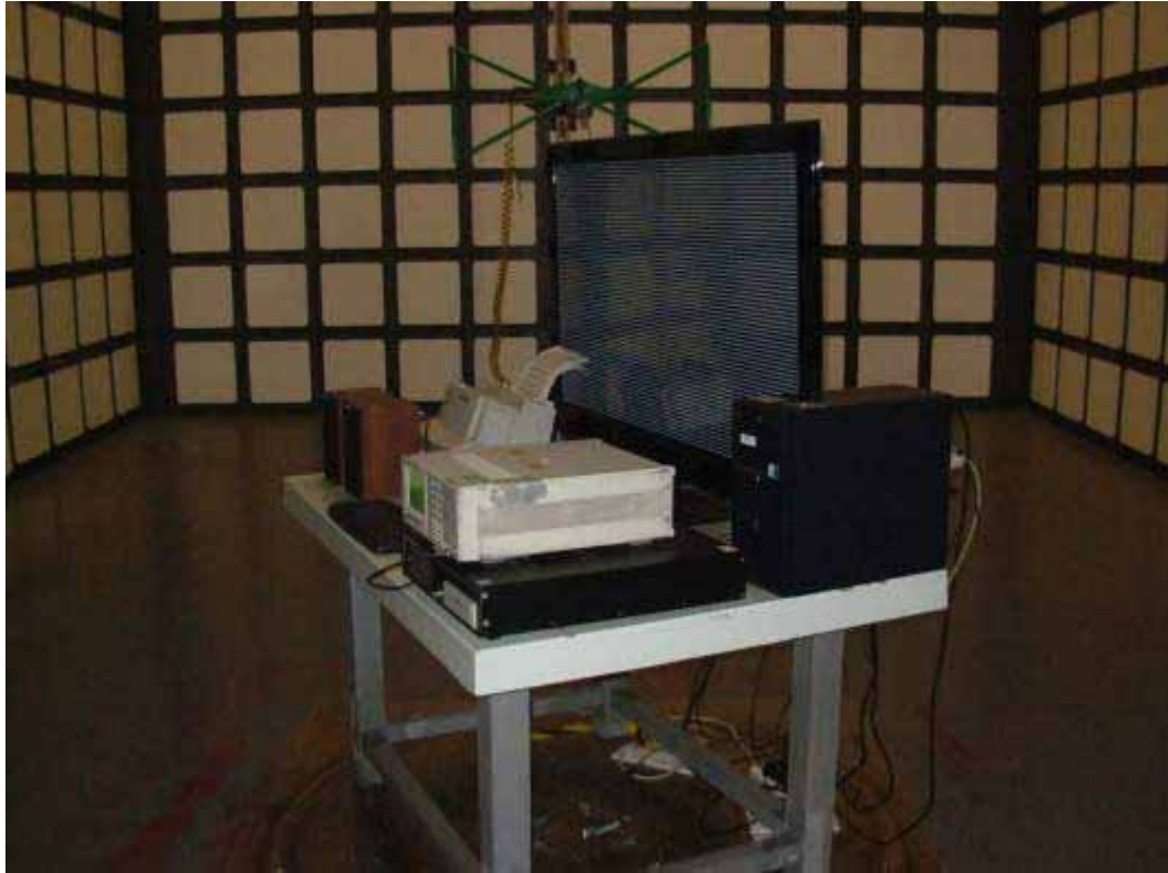
SETUP WITH MAXIMUM DETECTED EMISSION AT HORIZONTAL POLARIZATION (D-SUB 800*600@60Hz)