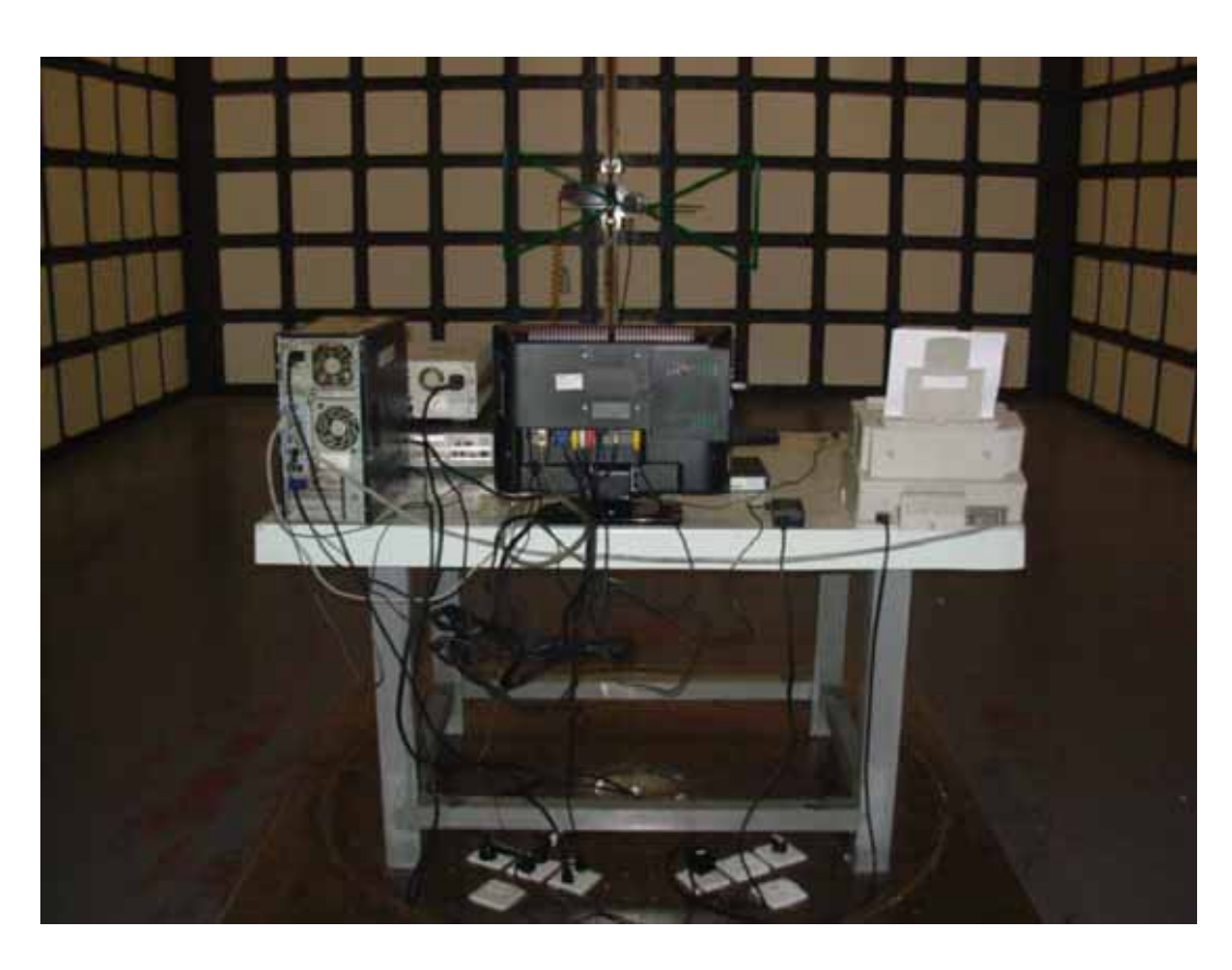
BACK VIEW OF RADIATED EMISSION TEST