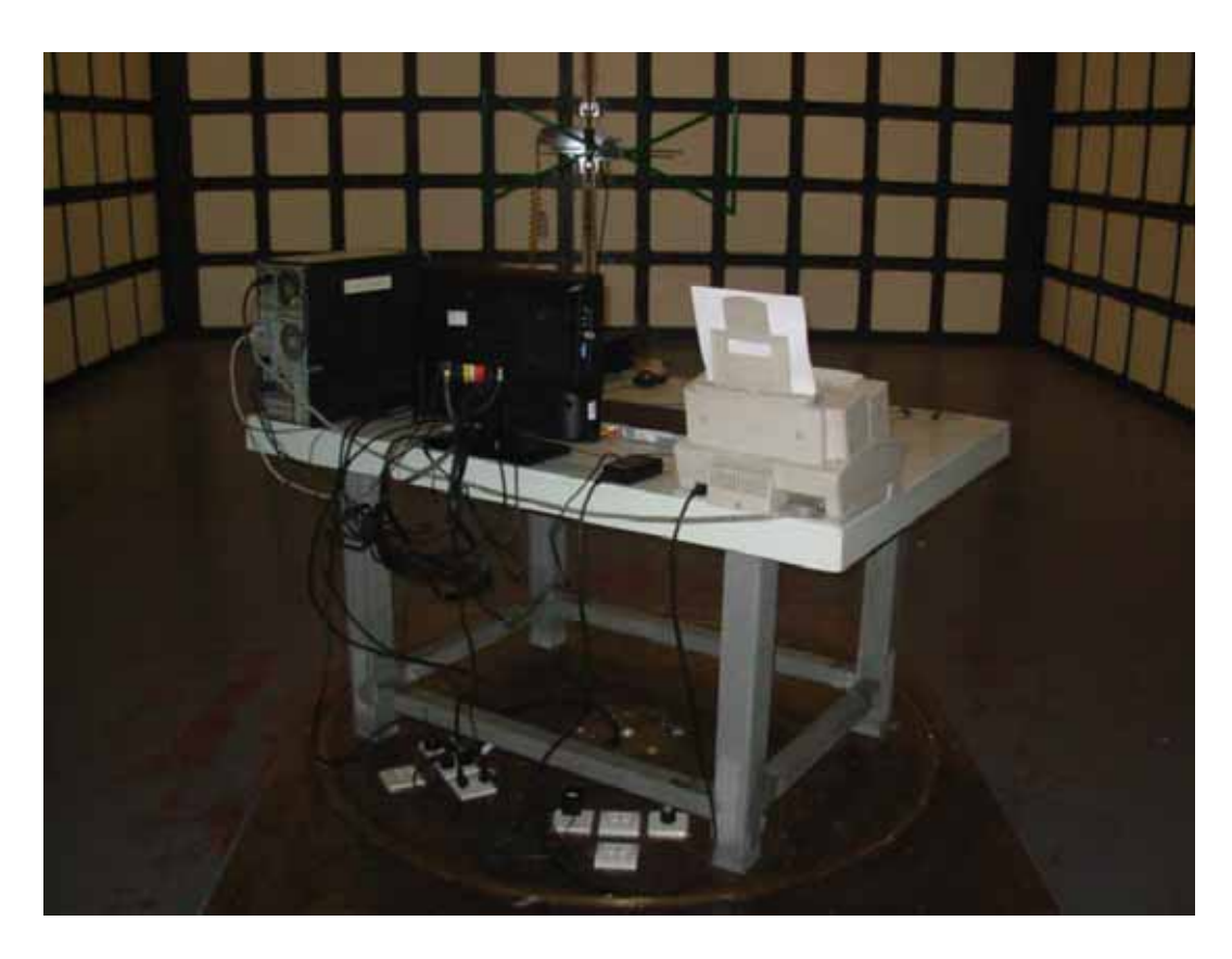
SETUP WITH MAXIMUM DETECTED EMISSION AT HORIZONTAL POLARIZATION (D-SUB 1360*768@60Hz)