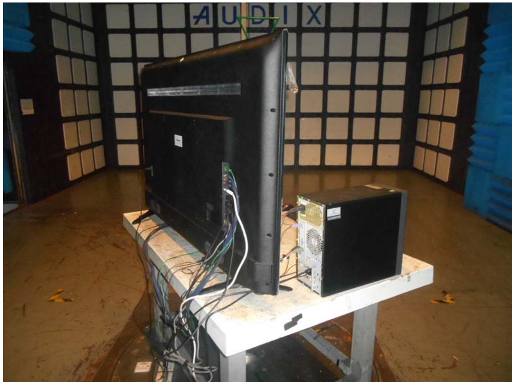
SETUP WITH MAXIMUM DETECTED EMISSION AT VERTICAL POLARIZATION (TEST MODE HDMI3 3840*2160@60HZ & 1KHZ PLAYING)