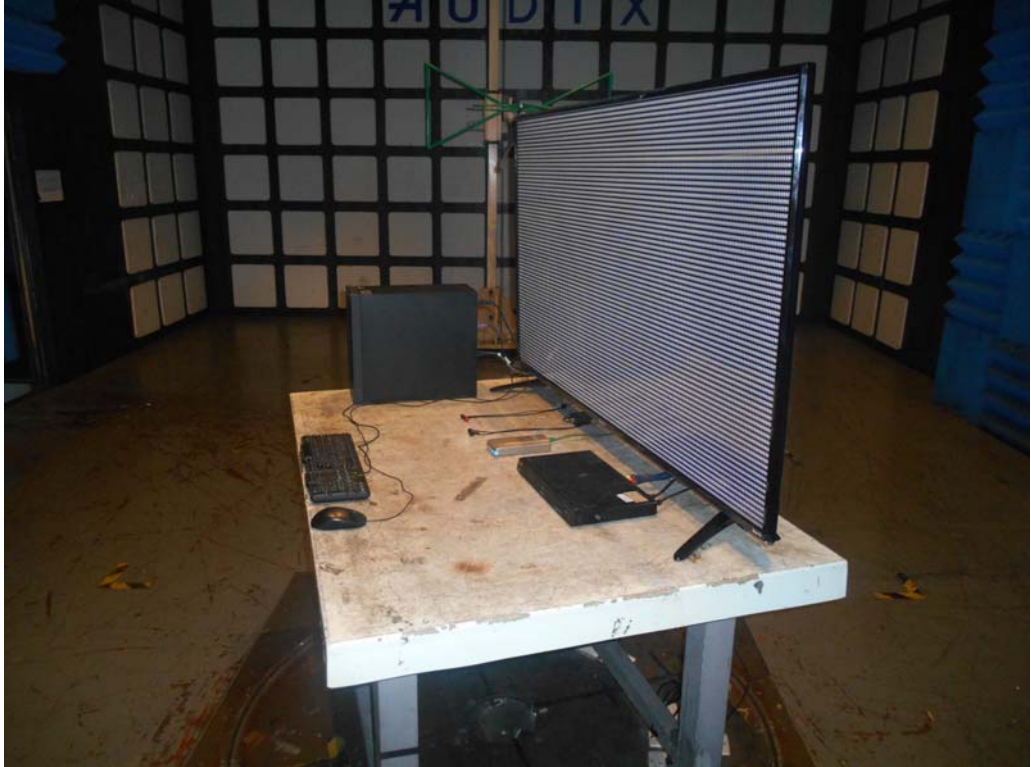
SETUP WITH MAXIMUM DETECTED EMISSION AT HORIZONTAL POLARIZATION (TEST MODE HDMI3 3840*2160@60HZ & 1KHZ PLAYING)