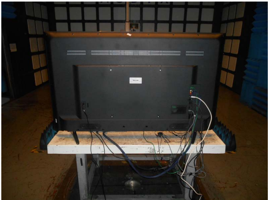
BACK VIEW OF RADIATED EMISSION TEST (ABOVE 1GHZ)