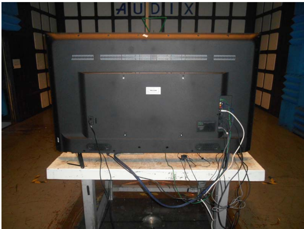
BACK VIEW OF RADIATED EMISSION TEST (BELOW 1GHZ)