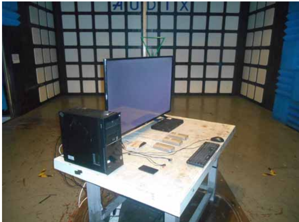
SETUP WITH MAXIMUM DETECTED EMISSION AT VERTICAL POLARIZATION (TEST MODE: HDMI1 3840*2160@60Hz & 1KHz PLAYING)