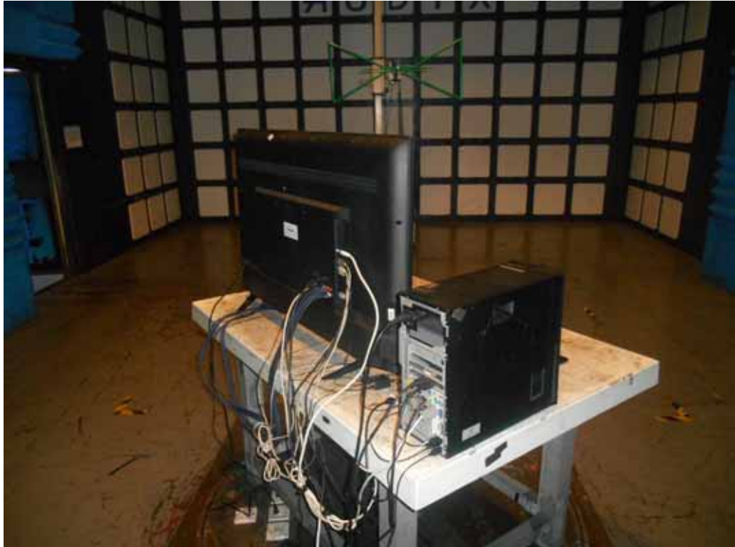
SETUP WITH MAXIMUM DETECTED EMISSION AT HORIZONTAL POLARIZATION (TEST MODE: HDMI1 3840*2160@60Hz & 1KHz PLAYING)