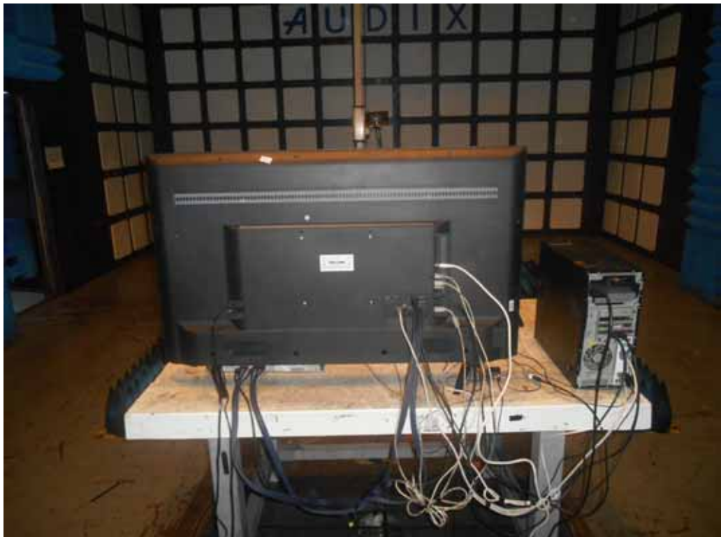
BACK VIEW OF RADIATED EMISSION TEST (ABOVE 1GHZ)