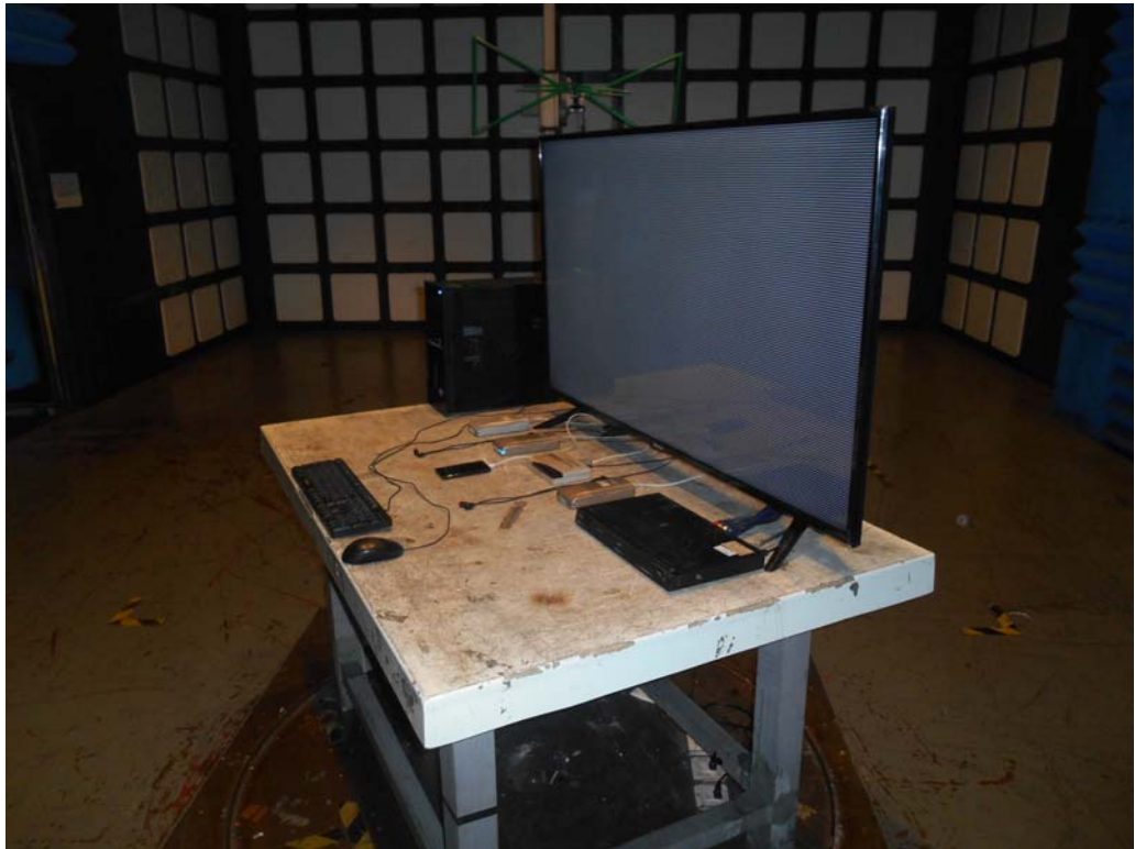
SETUP WITH MAXIMUM DETECTED EMISSION AT HORIZONTAL POLARIZATION (TEST MODE: HDMI2 3840*2160@60Hz & 1kHz PLAYING)