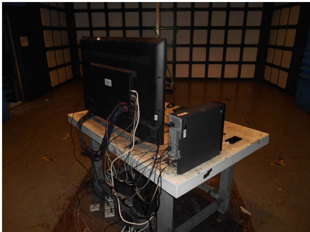
SETUP WITH MAXIMUM DETECTED EMISSION AT VERTICAL POLARIZATION (TEST MODE: HDMI 3840*2160@60Hz & 1kHz PLAYING)