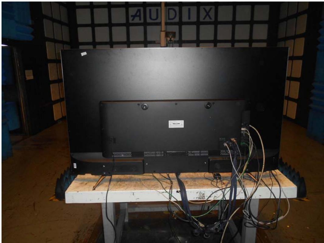
BACK VIEW OF RADIATED EMISSION TEST (ABOVE 1GHZ)