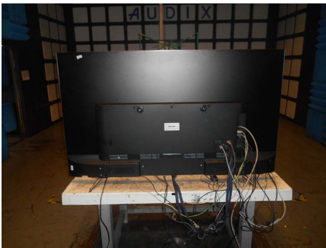
BACK VIEW OF RADIATED EMISSION TEST (BELOW 1GHZ)