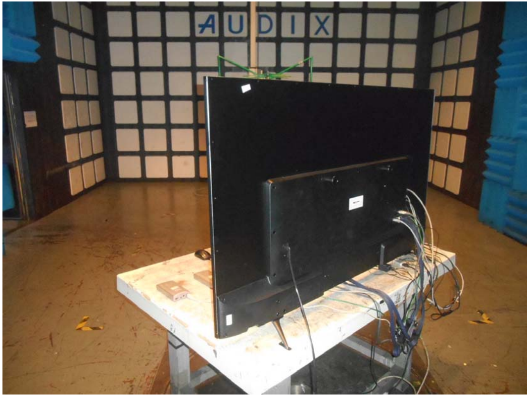
SETUP WITH MAXIMUM DETECTED EMISSION AT HORIZONTAL POLARIZATION (TEST MODE: HDMI2 3840*2160@60Hz & 1KHz PLAYING)