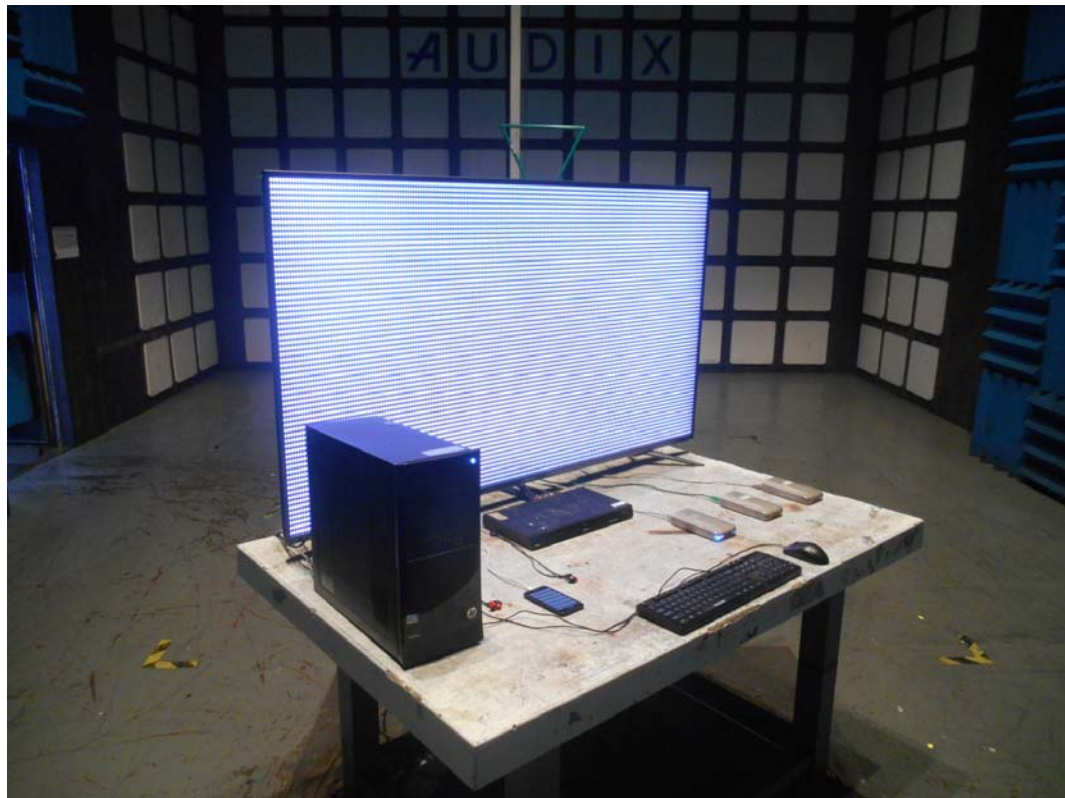
SETUP WITH MAXIMUM DETECTED EMISSION AT VERTICAL POLARIZATION (TEST MODE: HDMI2 3840*2160@60Hz & 1KHz PLAYING)