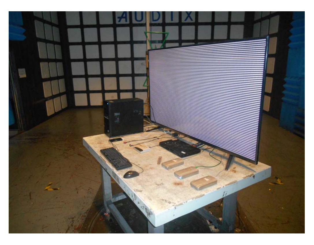
SETUP WITH MAXIMUM DETECTED EMISSION AT VERTICAL POLARIZATION (TEST MODE: HDMI1 3840*2160@60Hz & 1kHz playing)