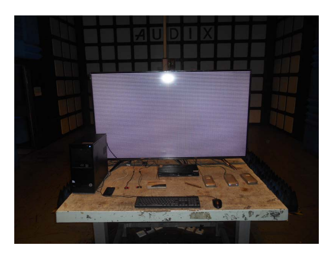
FRONT VIEW OF RADIATED EMISSION TEST (ABOVE 1GHZ)