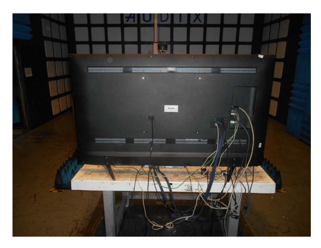
BACK VIEW OF RADIATED EMISSION TEST (ABOVE 1GHZ)