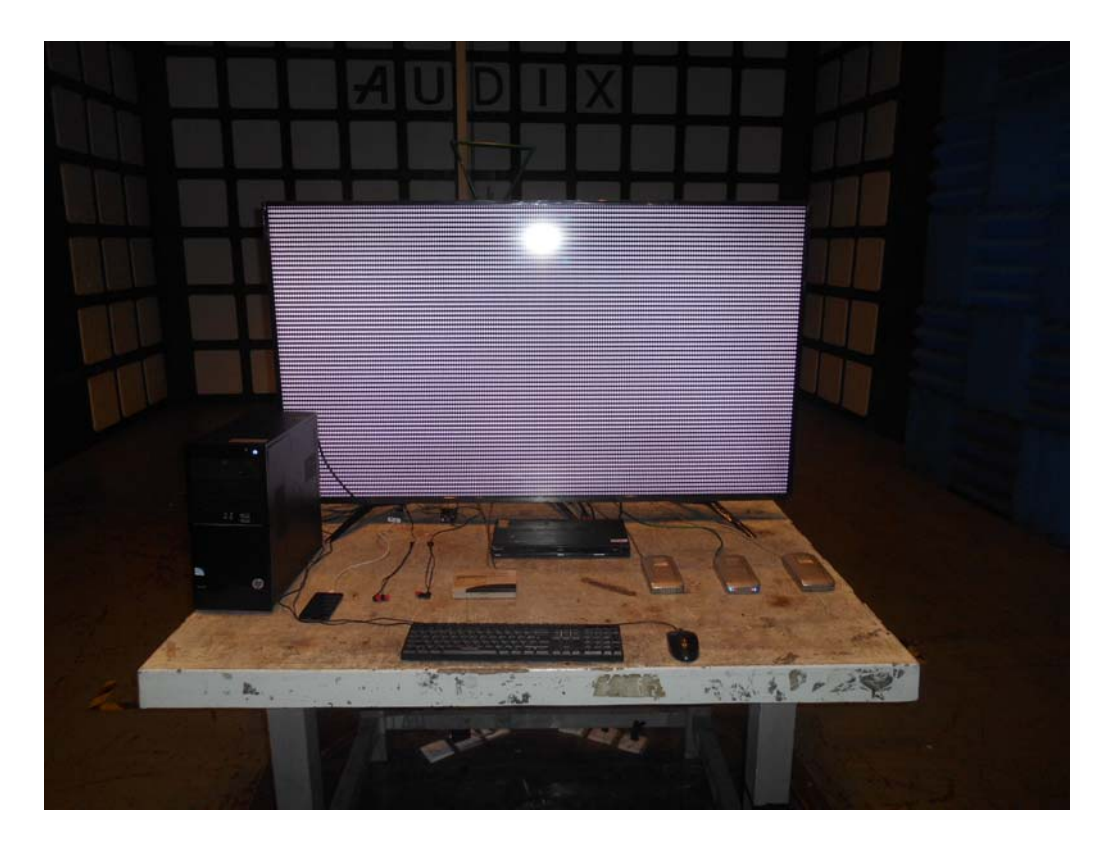
FRONT VIEW OF RADIATED EMISSION TEST (BELOW 1GHZ)