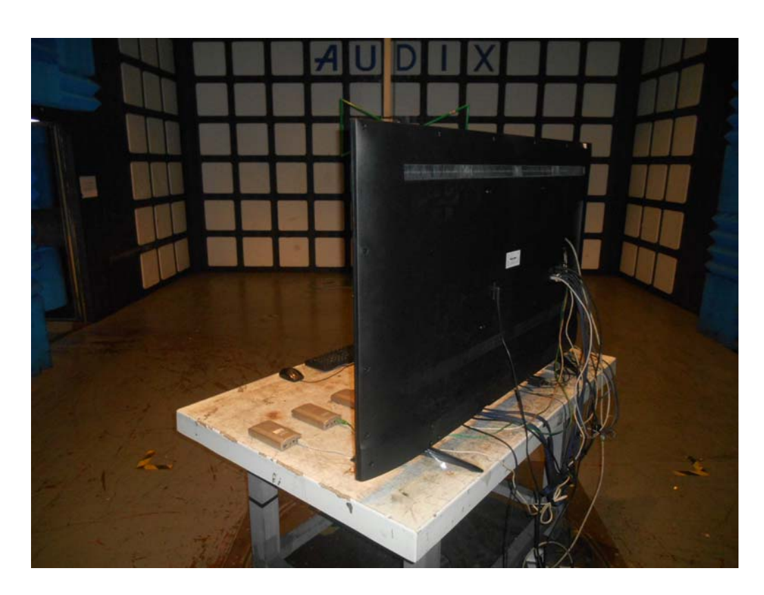
SETUP WITH MAXIMUM DETECTED EMISSION AT HORIZONTAL POLARIZATION (TEST MODE: HDM11 3840*2160@60Hz & 1kHz playing)