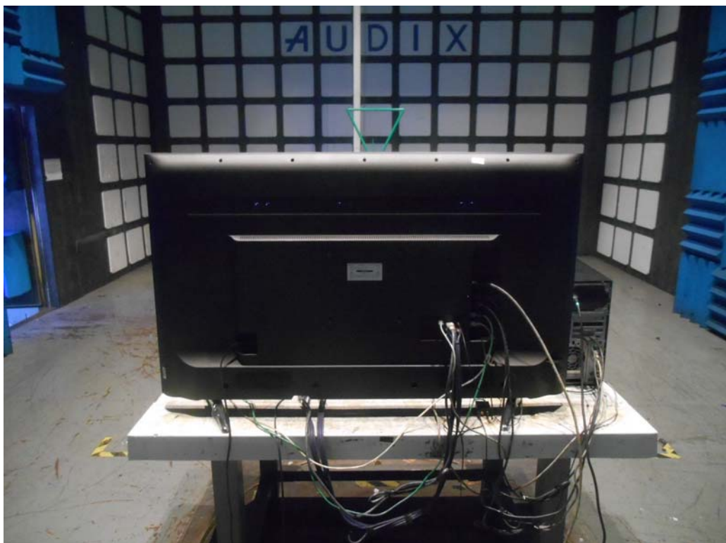
BACK VIEW OF RADIATED EMISSION TEST (BELOW 1GHz)