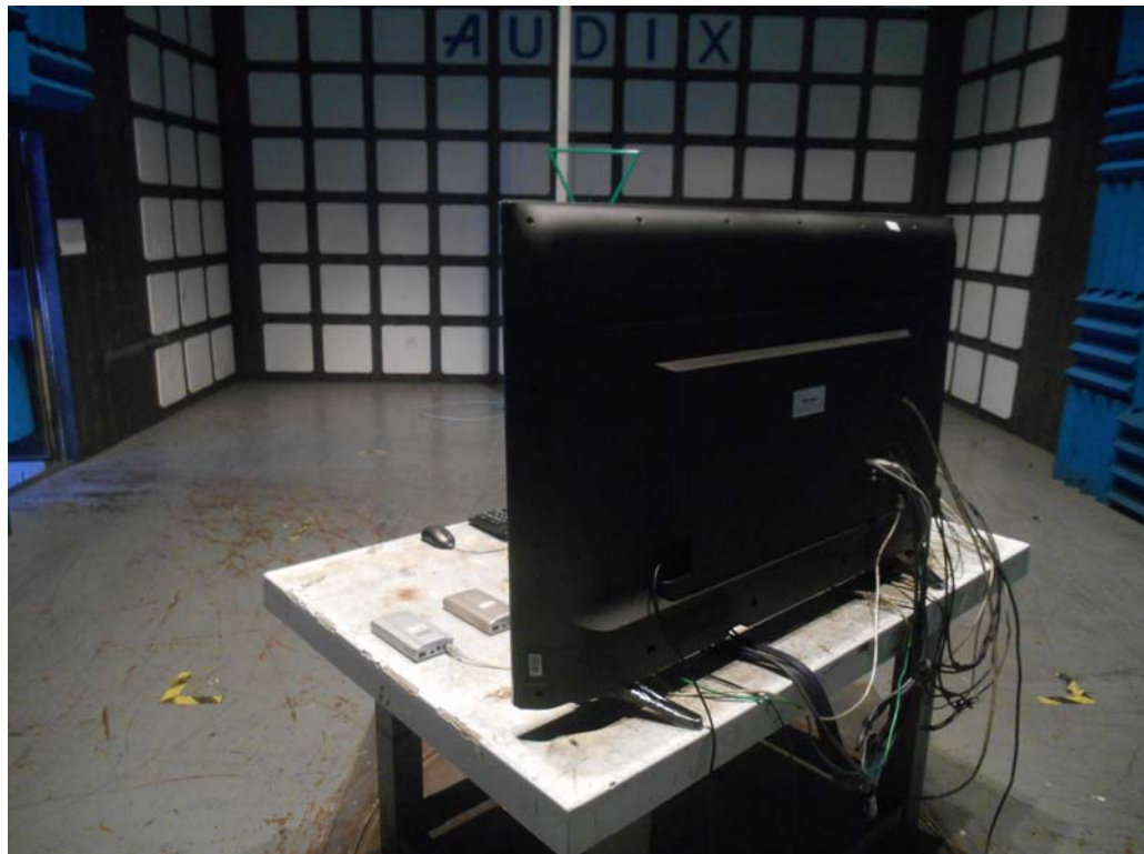
SETUP WITH MAXIMUM DETECTED EMISSION AT VERTICAL POLARIZATION (TEST MODE: HDMI 1920*1080@60Hz & 1kHz PLAYING)