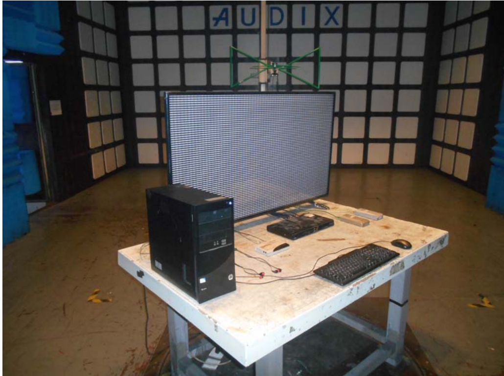
SETUP WITH MAXIMUM DETECTED EMISSION AT HORIZONTAL POLARIZATION (TEST MODE: HDMI 1920*1080@60Hz & 1kHz PLAYING)