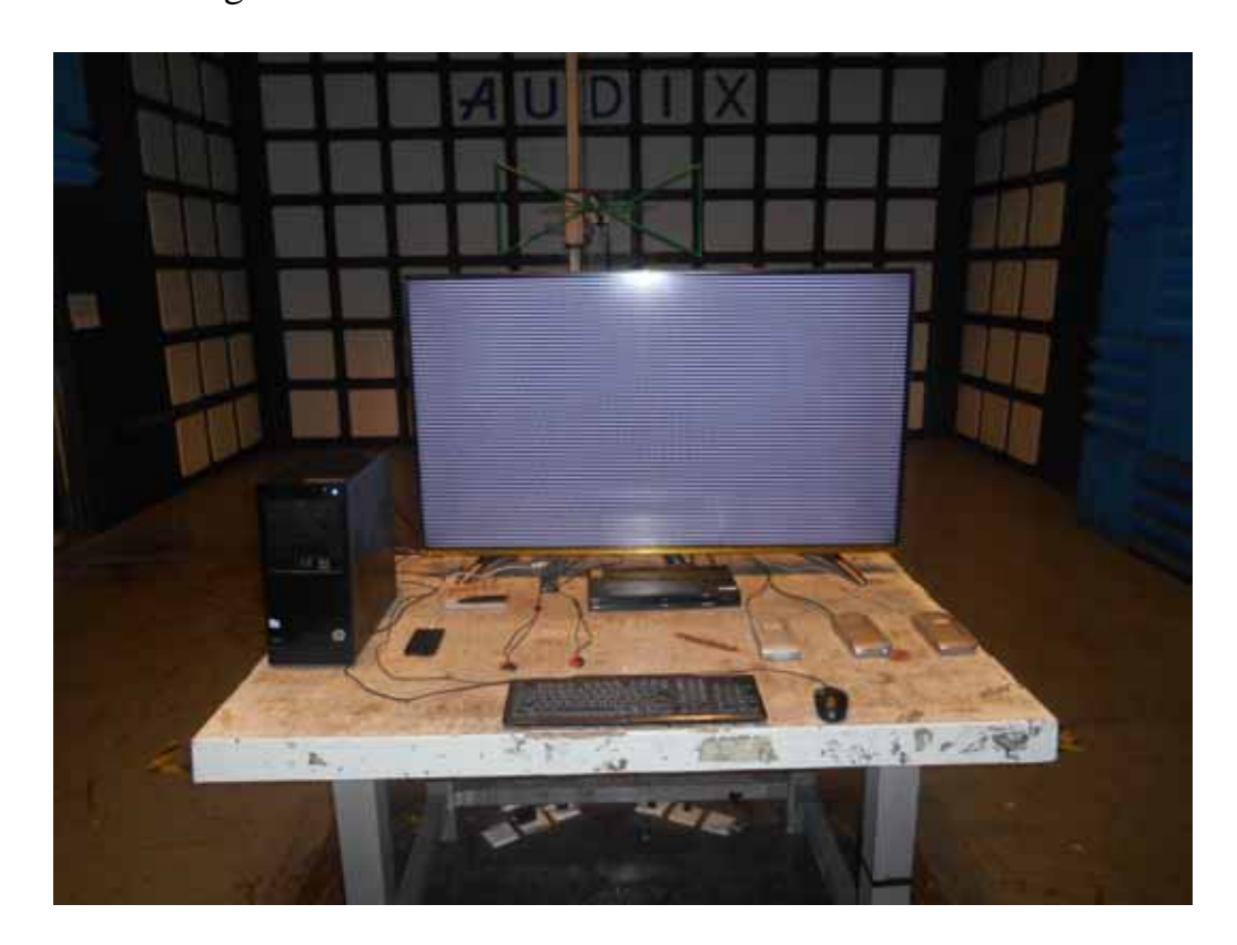
FRONT VIEW OF RADIATED EMISSION TEST (BELOW 1GHZ)