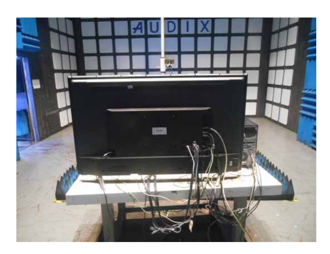
BACK VIEW OF RADIATED EMISSION TEST (ABOVE 1GHZ)