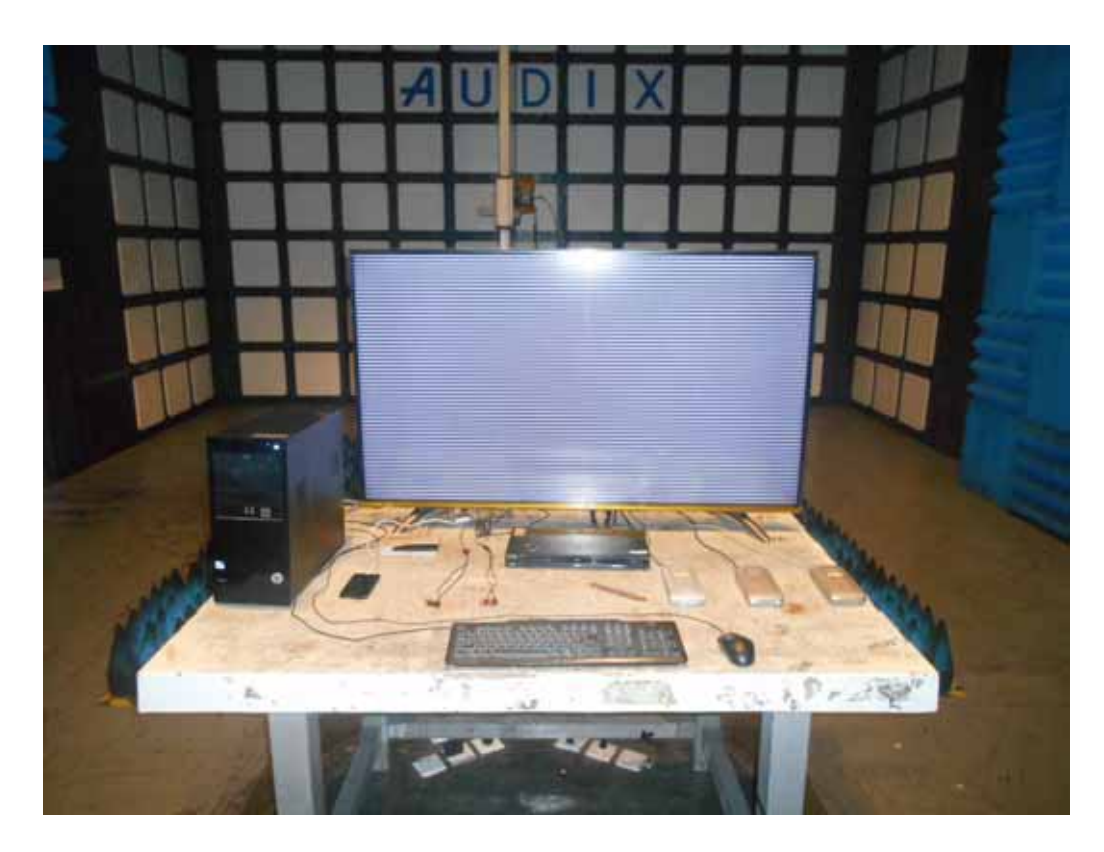
FRONT VIEW OF RADIATED EMISSION TEST (ABOVE 1GHZ)