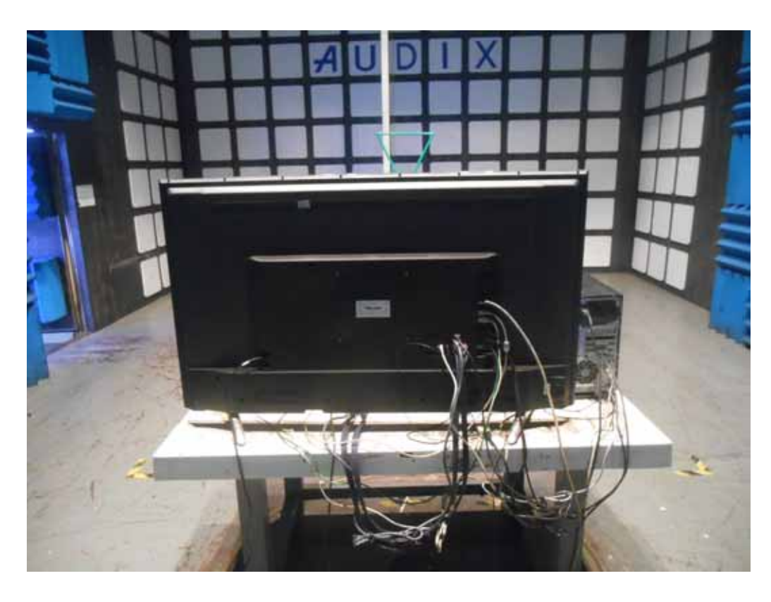
BACK VIEW OF RADIATED EMISSION TEST (BELOW 1GHZ)