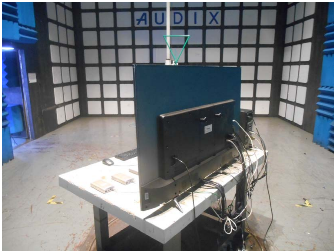
SETUP WITH MAXIMUM DETECTED EMISSION AT VERTICAL POLARIZATION (TEST MODE: HDMI 3840*2160@60HZ & 1KHZ PLAYING)