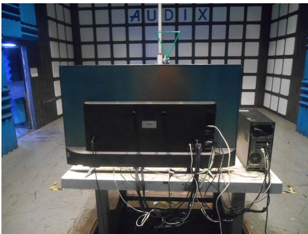
BACK VIEW OF RADIATED EMISSION TEST (BELOW 1GHZ)