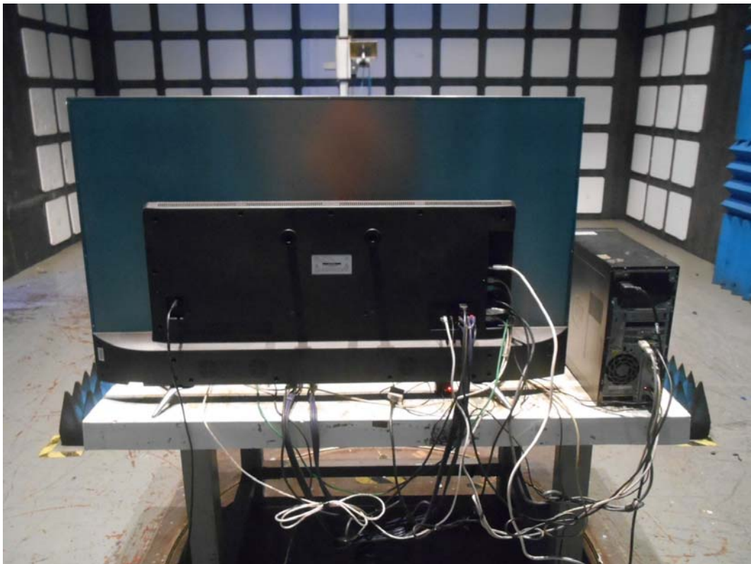
BACK VIEW OF RADIATED EMISSION TEST (ABOVE 1GHZ)