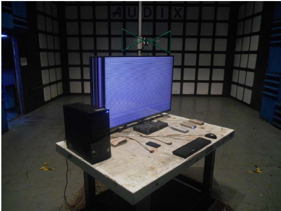
SETUP WITH MAXIMUM DETECTED EMISSION AT HORIZONTAL POLARIZATION (TEST MODE: HDMI 3840*2160@60HZ & 1KHZ PLAYING)