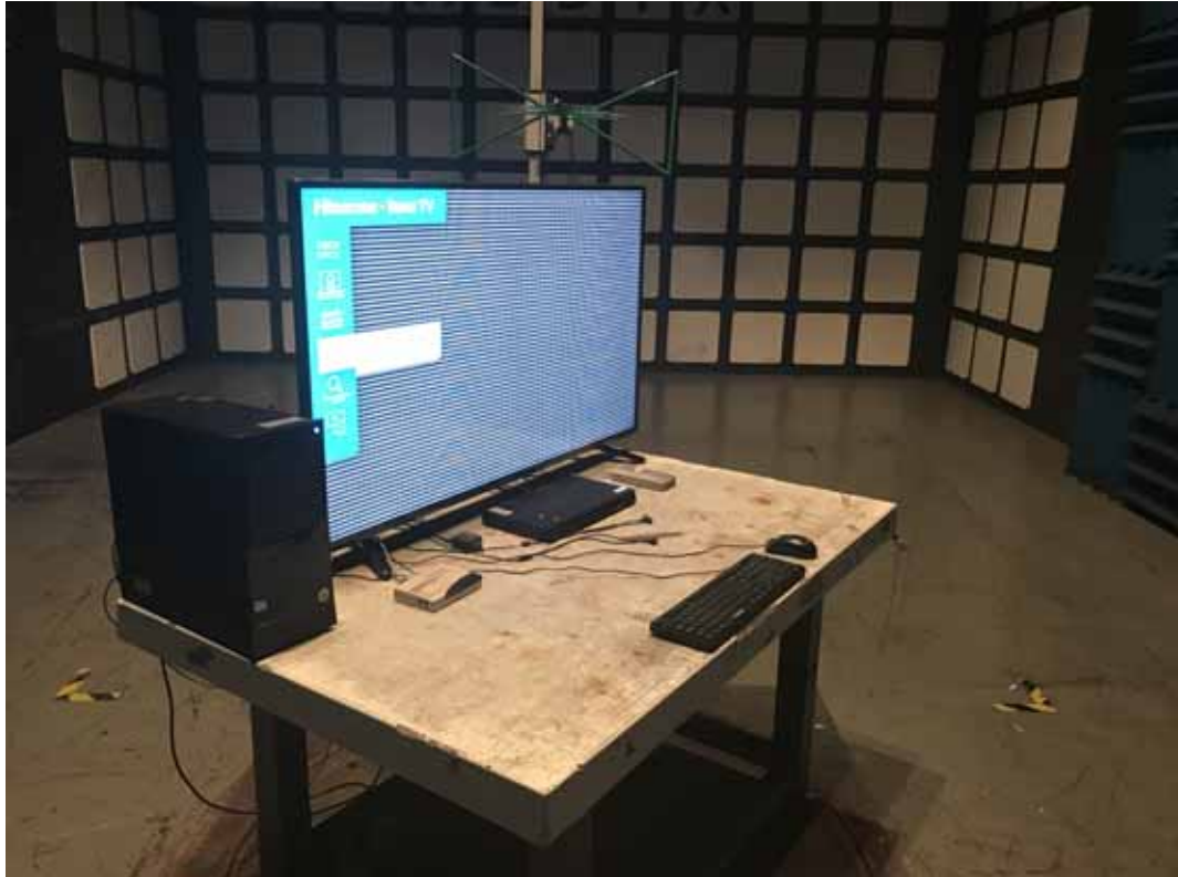
SETUP WITH MAXIMUM DETECTED EMISSION AT HORIZONTAL POLARIZATION (TEST MODE: HDMI1 1920*1080@60Hz & 1kHz)