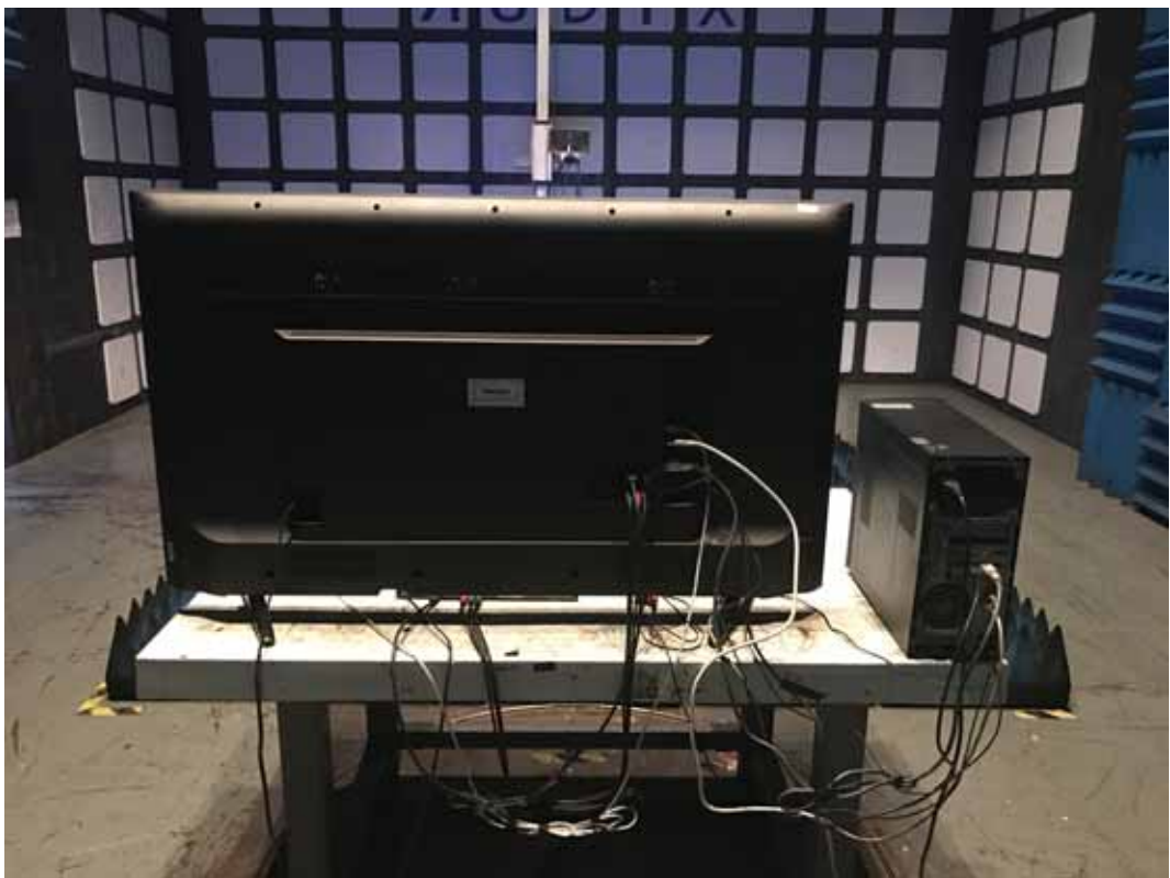
BACK VIEW OF RADIATED EMISSION TEST (ABOVE 1GHZ)