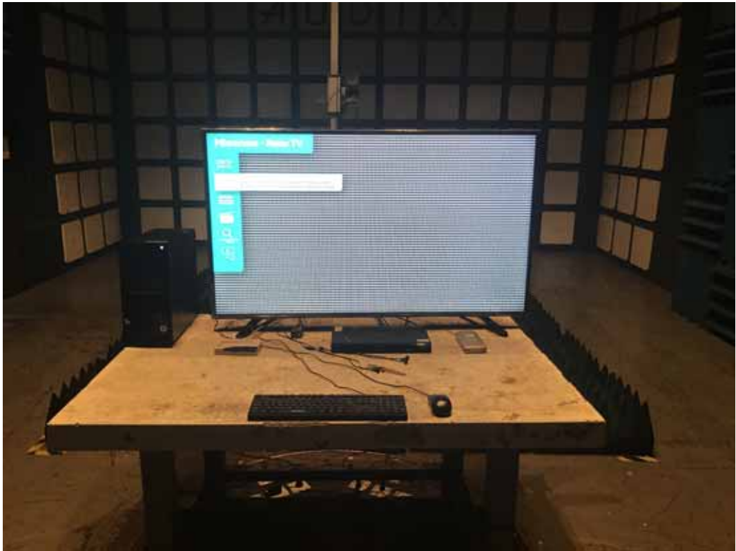
FRONT VIEW OF RADIATED EMISSION TEST (ABOVE 1GHZ)