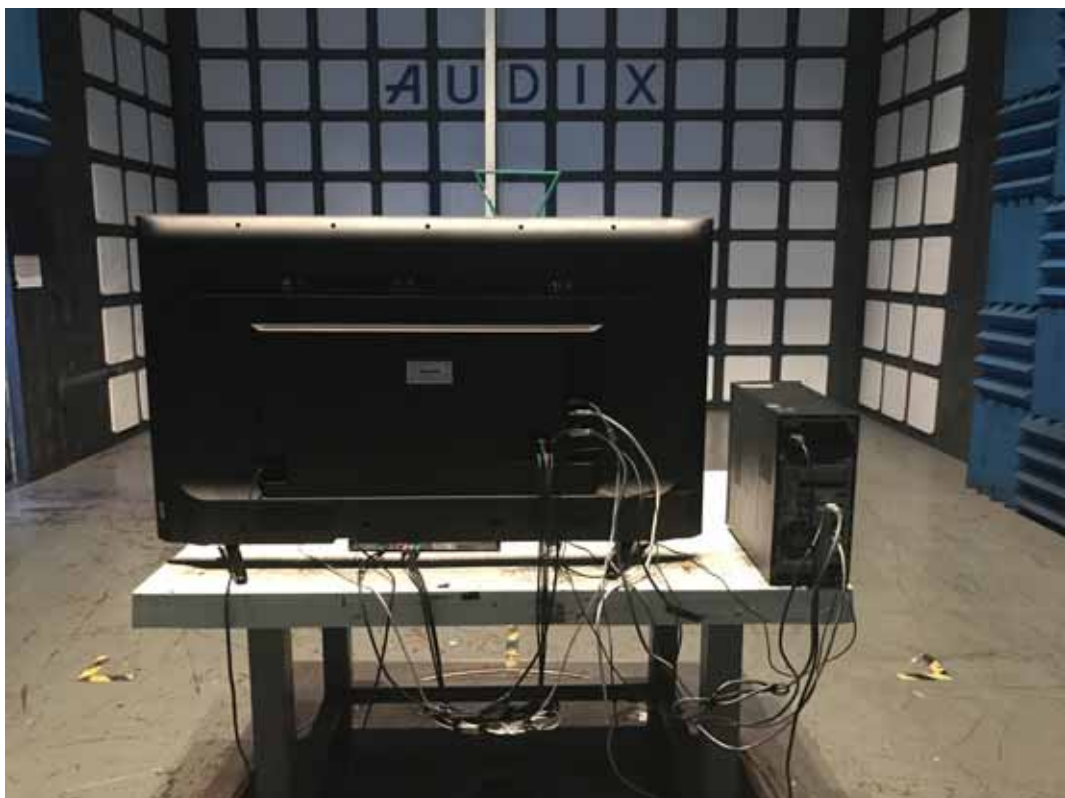
BACK VIEW OF RADIATED EMISSION TEST (BELOW 1GHZ)