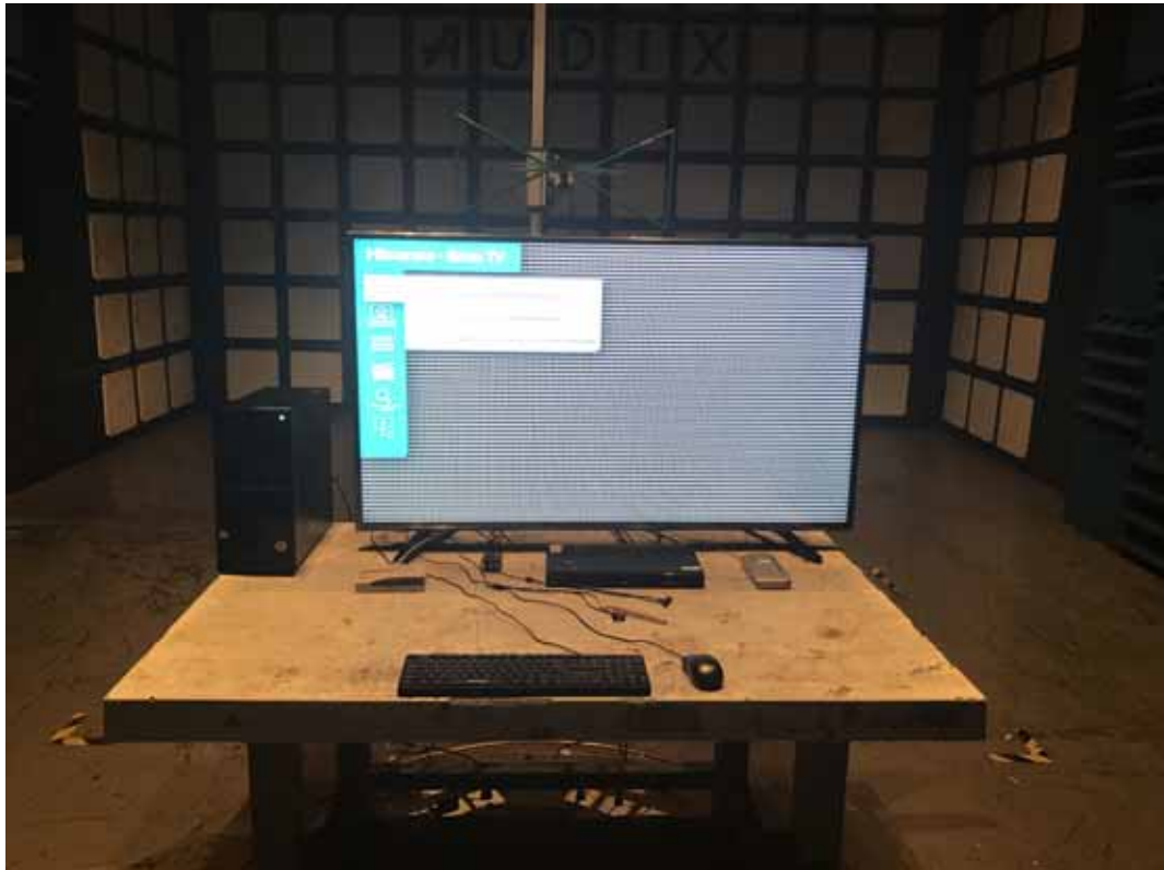
FRONT VIEW OF RADIATED EMISSION TEST (BELOW 1GHZ)