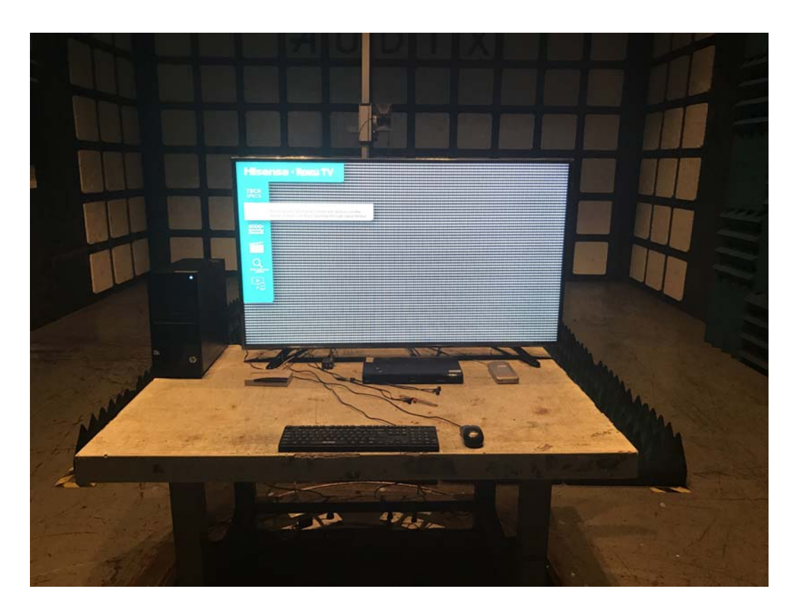
Front View of Radiated Emission Test (Above 1GHz)