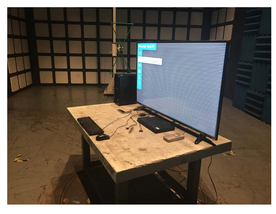
SETUP WITH MAXIMUM DETECTED EMISSION AT VERTICAL POLARIZATION (TEST MODE: HDMI1 1920*1080@60Hz & 1kHz playing)