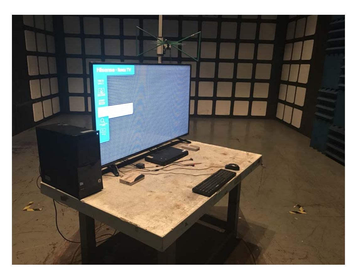
SETUP WITH MAXIMUM DETECTED EMISSION AT HORIZONTAL POLARIZATION (TEST MODE: HDMI1 1920*1080@60Hz & 1kHz playing)