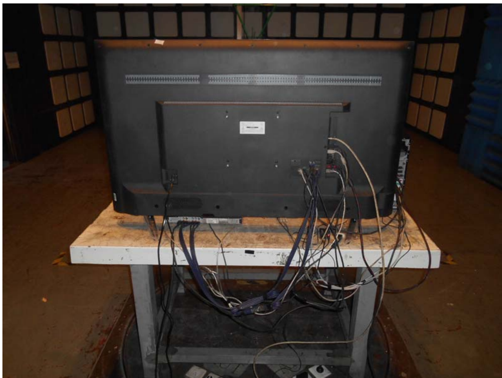
BACK VIEW OF RADIATED EMISSION TEST (BELOW 1GHZ)