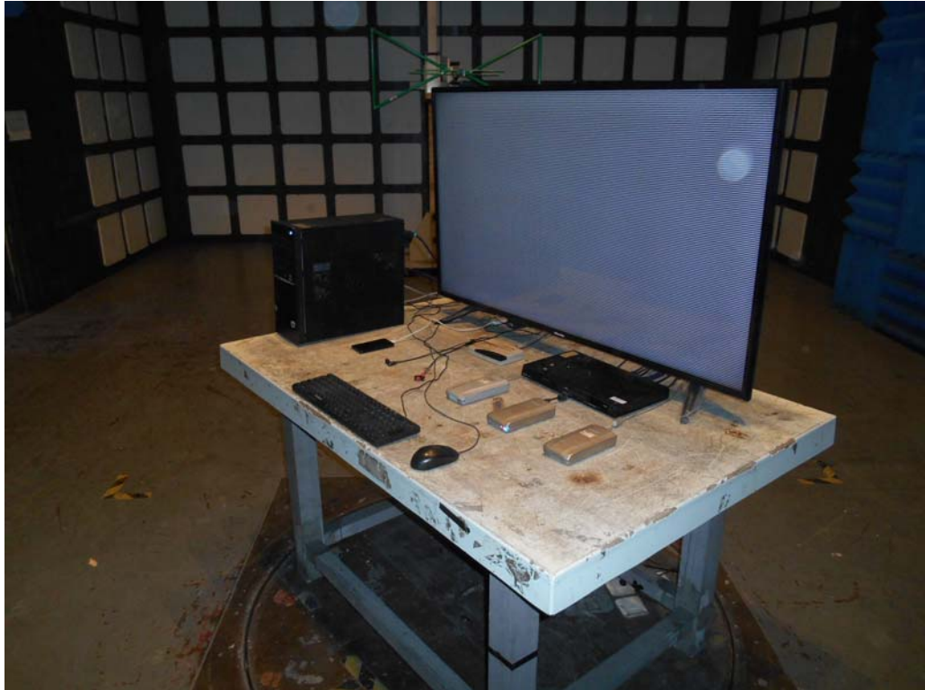
SETUP WITH MAXIMUM DETECTED EMISSION AT HORIZONTAL POLARIZATION (TEST MODE: HDMI 3840*2160@60Hz & 1kHz PLAYING)