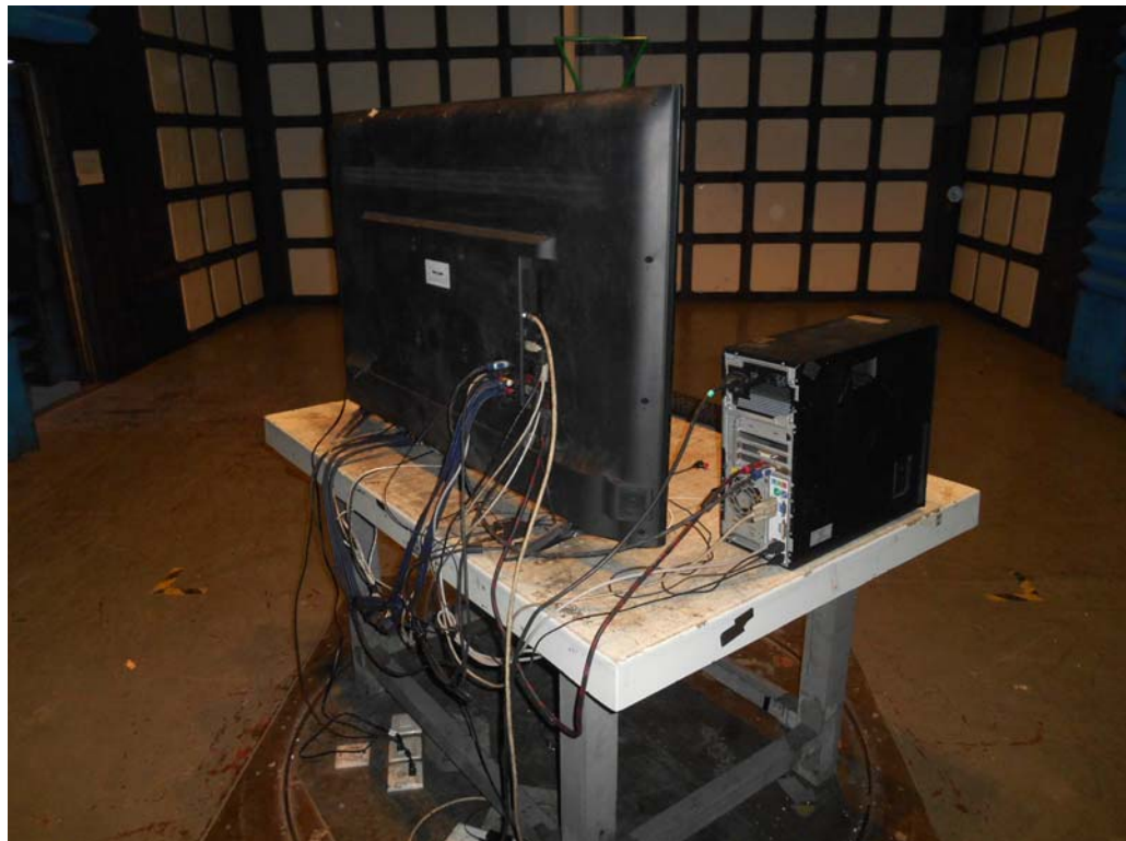
SETUP WITH MAXIMUM DETECTED EMISSION AT VERTICAL POLARIZATION (TEST MODE: HDMI 3840*2160@60Hz & 1kHz PLAYING)