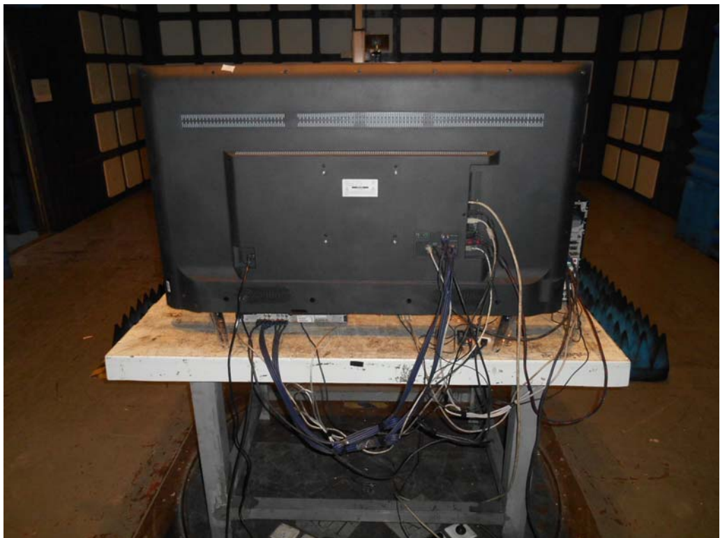
BACK VIEW OF RADIATED EMISSION TEST (ABOVE 1GHZ)