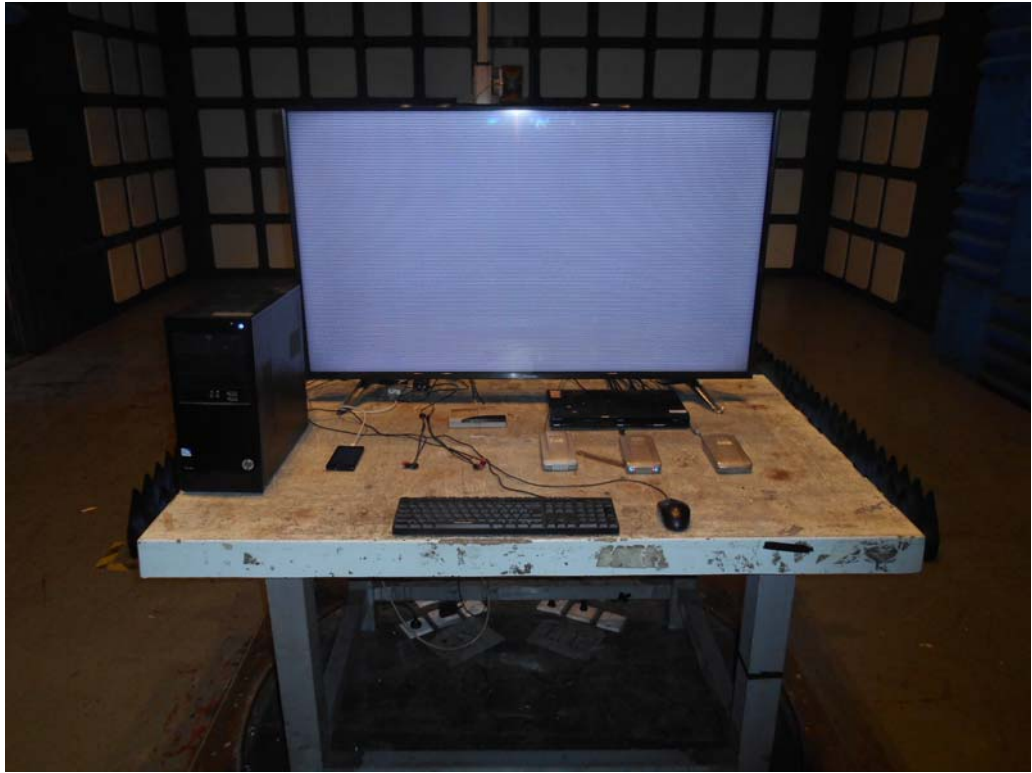
FRONT VIEW OF RADIATED EMISSION TEST (ABOVE 1GHZ)