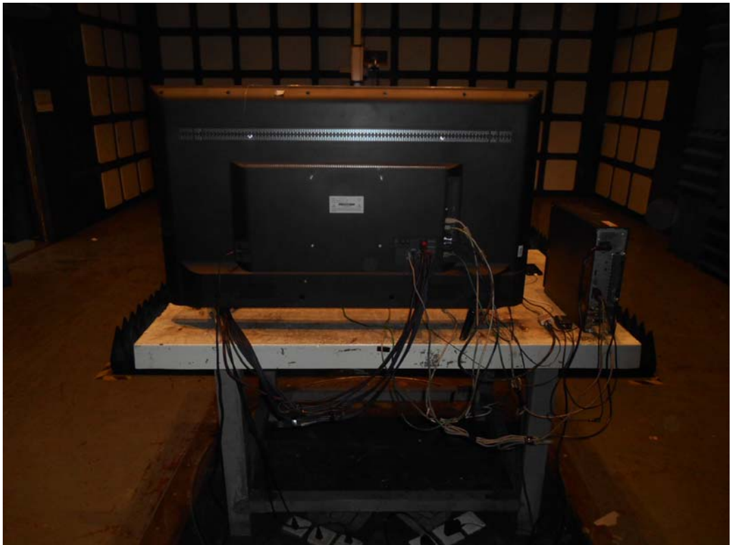
BACK VIEW OF RADIATED EMISSION TEST (ABOVE 1GHZ)