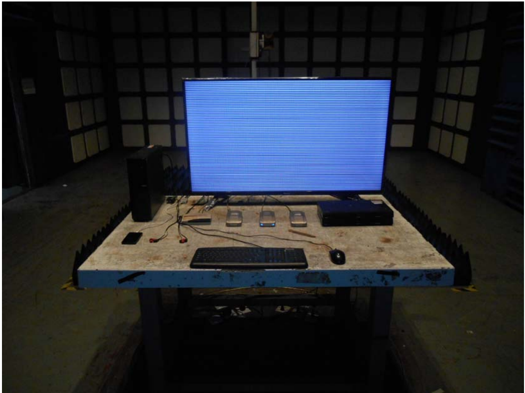
FRONT VIEW OF RADIATED EMISSION TEST (ABOVE 1GHZ)