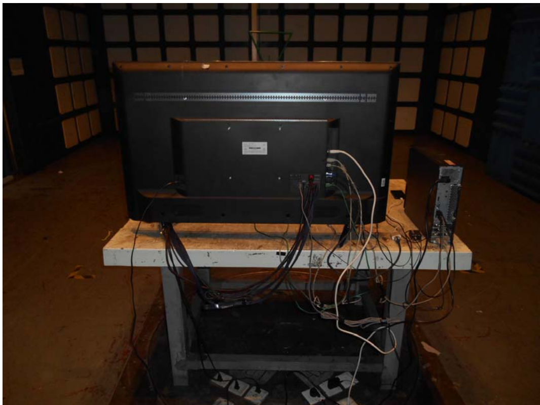
BACK VIEW OF RADIATED EMISSION TEST (BELOW 1GHZ)