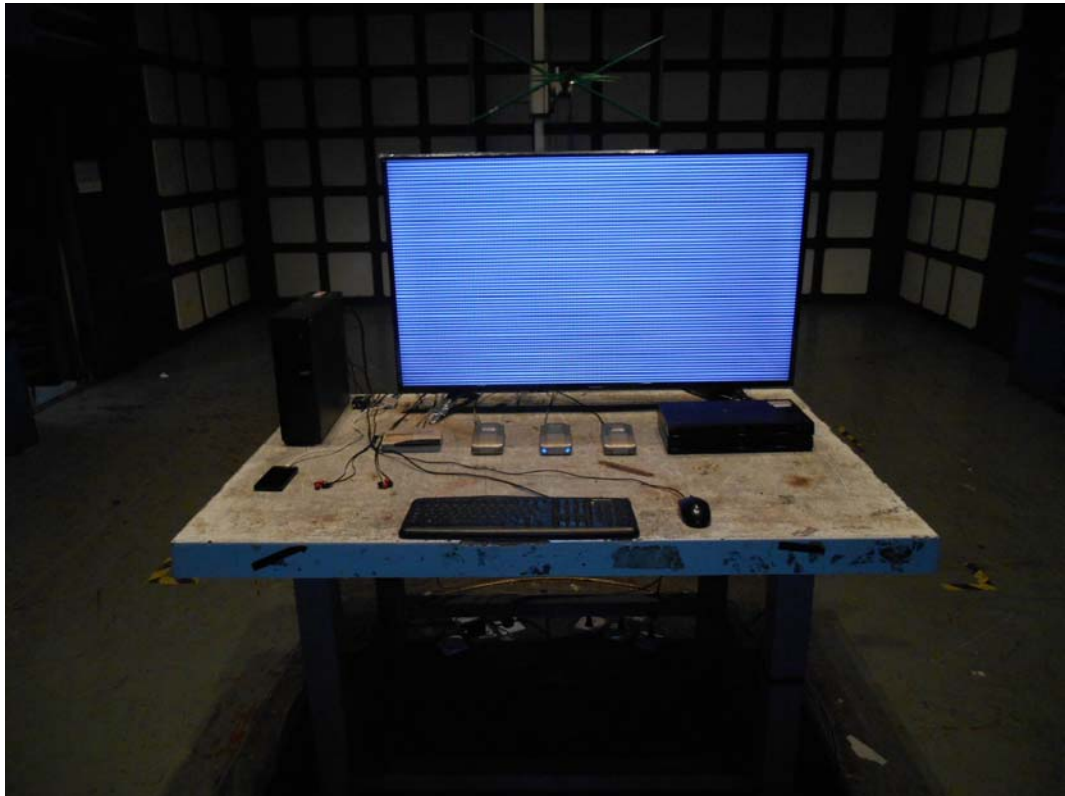
FRONT VIEW OF RADIATED EMISSION TEST (BELOW 1GHZ)