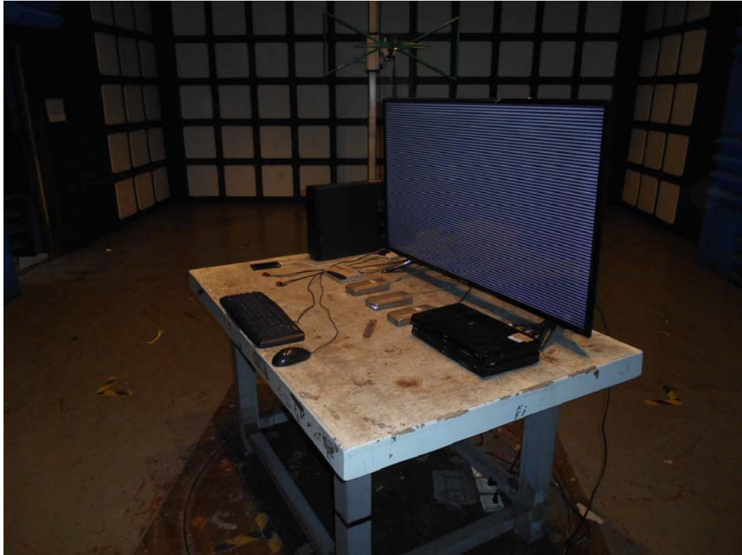
SETUP WITH MAXIMUM DETECTED EMISSION AT HORIZONTAL POLARIZATION (TEST MODE: HDMI 3840*2160@60Hz & 1kHz PLAYING)