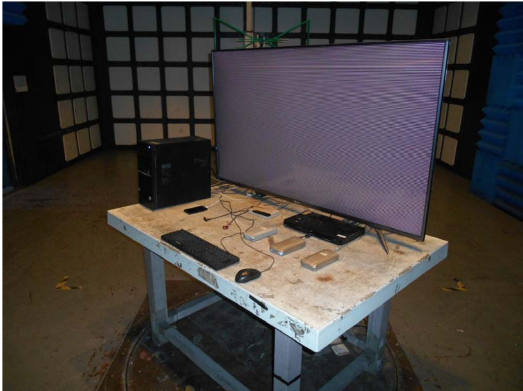
SETUP WITH MAXIMUM DETECTED EMISSION AT HORIZONTAL POLARIZATION (TEST MODE: HDMI 3840*2160@60Hz & 1KHz PLAYING)