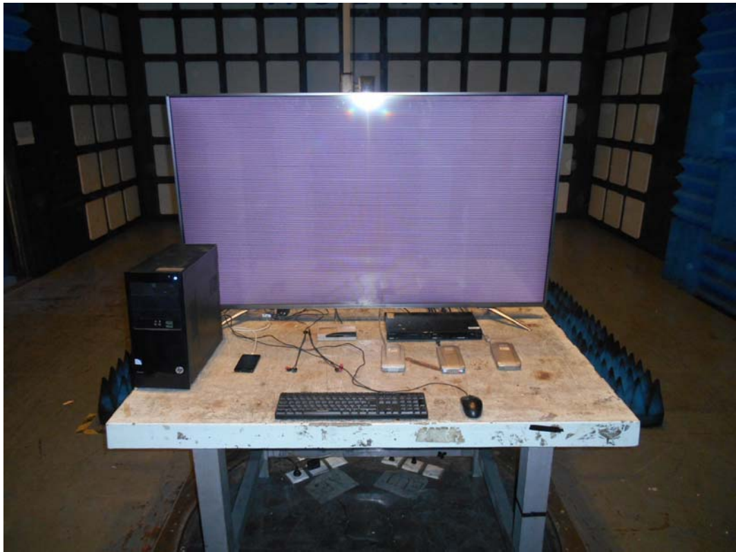
FRONT VIEW OF RADIATED EMISSION TEST (ABOVE 1GHZ)