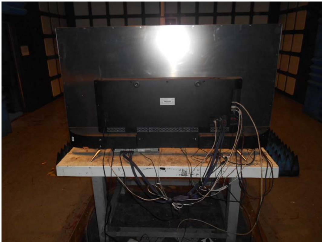
BACK VIEW OF RADIATED EMISSION TEST (ABOVE 1GHZ)