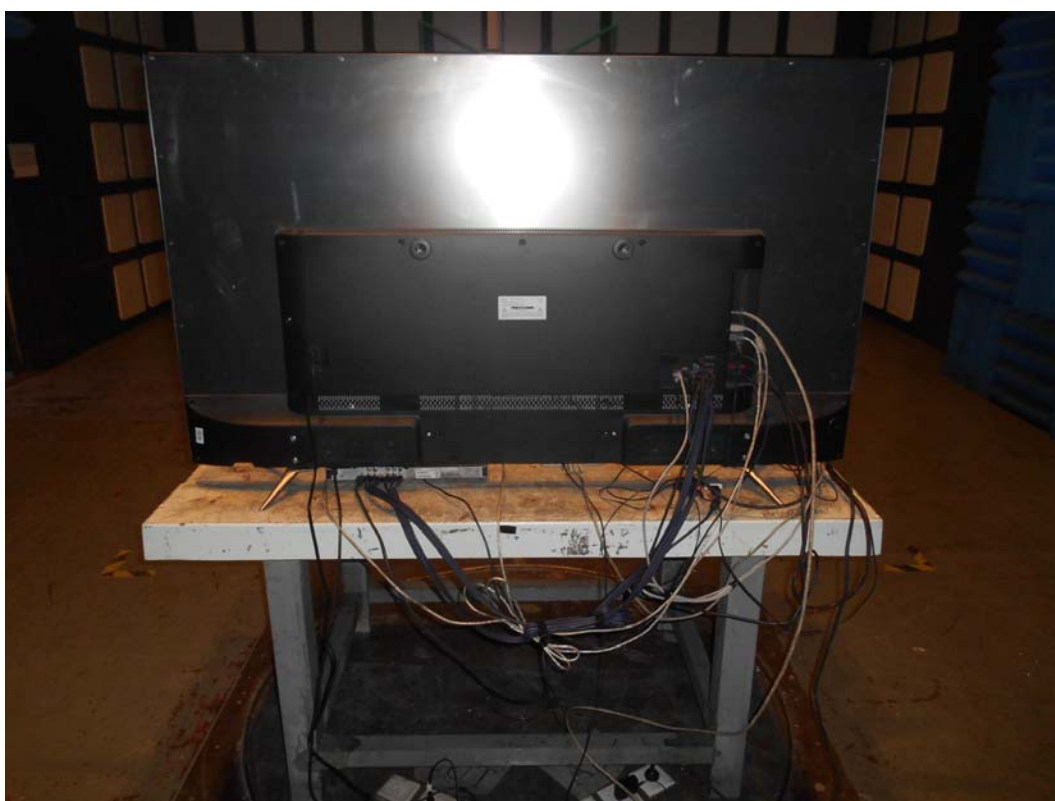
BACK VIEW OF RADIATED EMISSION TEST (BELOW 1GHZ)