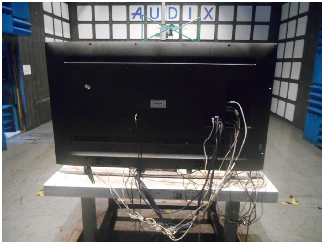
BACK VIEW OF RADIATED EMISSION TEST (BELOW 1GHZ)