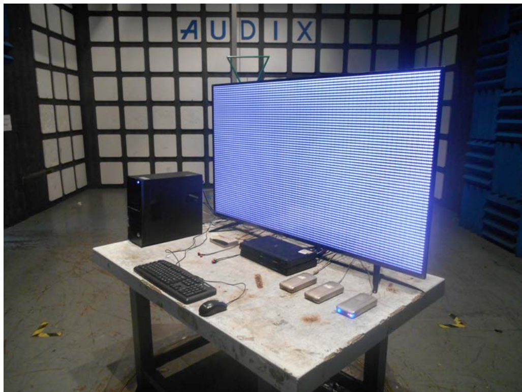
SETUP WITH MAXIMUM DETECTED EMISSION AT VERTICAL POLARIZATION (TEST MODE: HDMI 3840*2160@60Hz & 1kHz PLAYING)