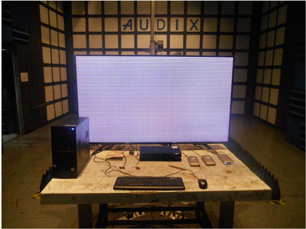
FRONT VIEW OF RADIATED EMISSION TEST (ABOVE 1GHZ)