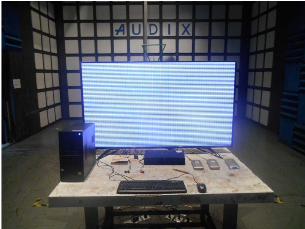
FRONT VIEW OF RADIATED EMISSION TEST (BELOW 1GHZ)