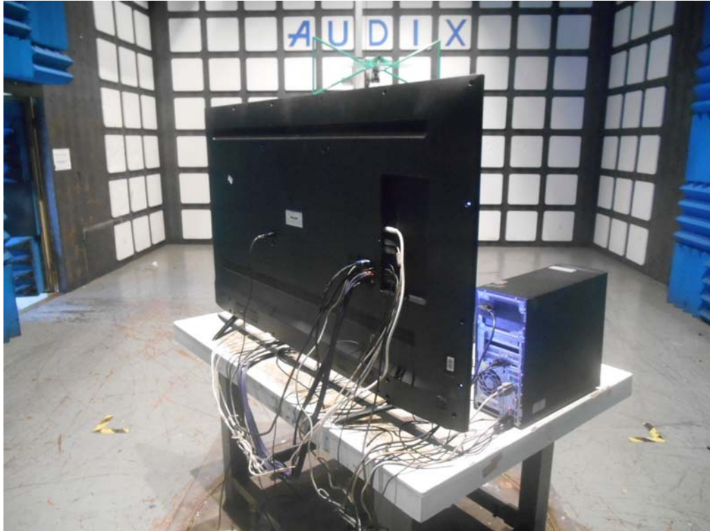
SETUP WITH MAXIMUM DETECTED EMISSION AT HORIZONTAL POLARIZATION (TEST MODE: HDMI 3840*2160@60Hz & 1kHz PLAYING)