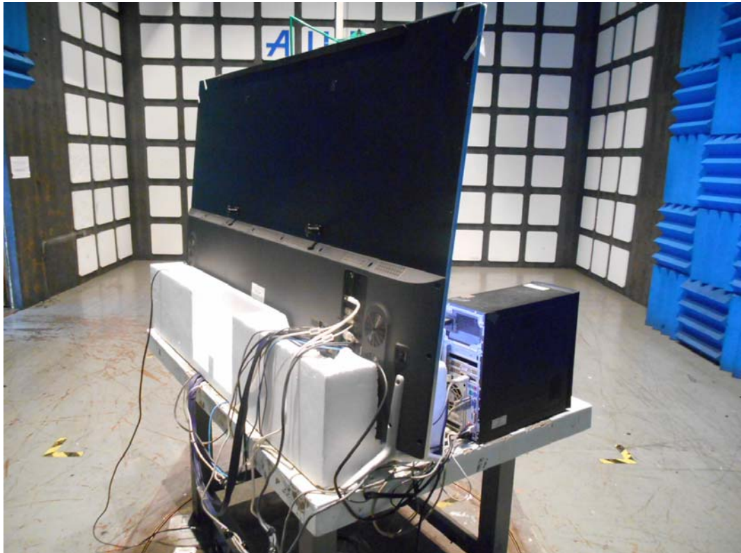
SETUP WITH MAXIMUM DETECTED EMISSION AT HORIZONTAL POLARIZATION (TEST MODE: HDMI 3840*2160@60Hz & 1KHz PLAYING)