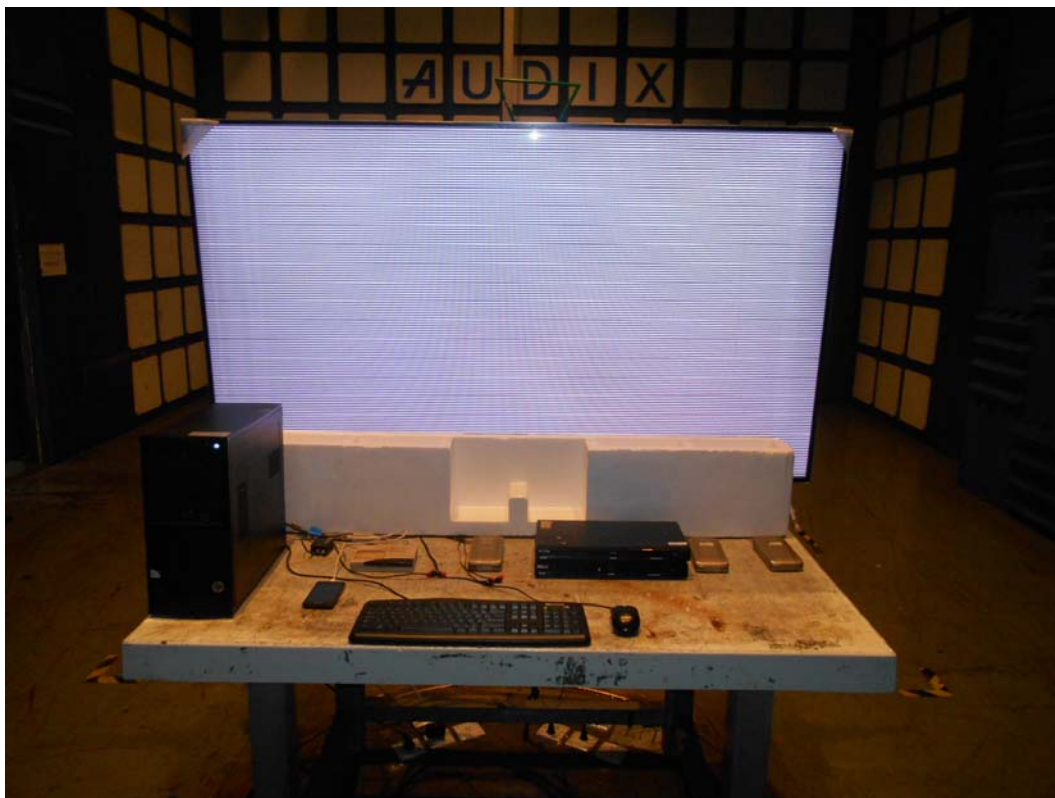
FRONT VIEW OF RADIATED EMISSION TEST (BELOW 1GHZ)