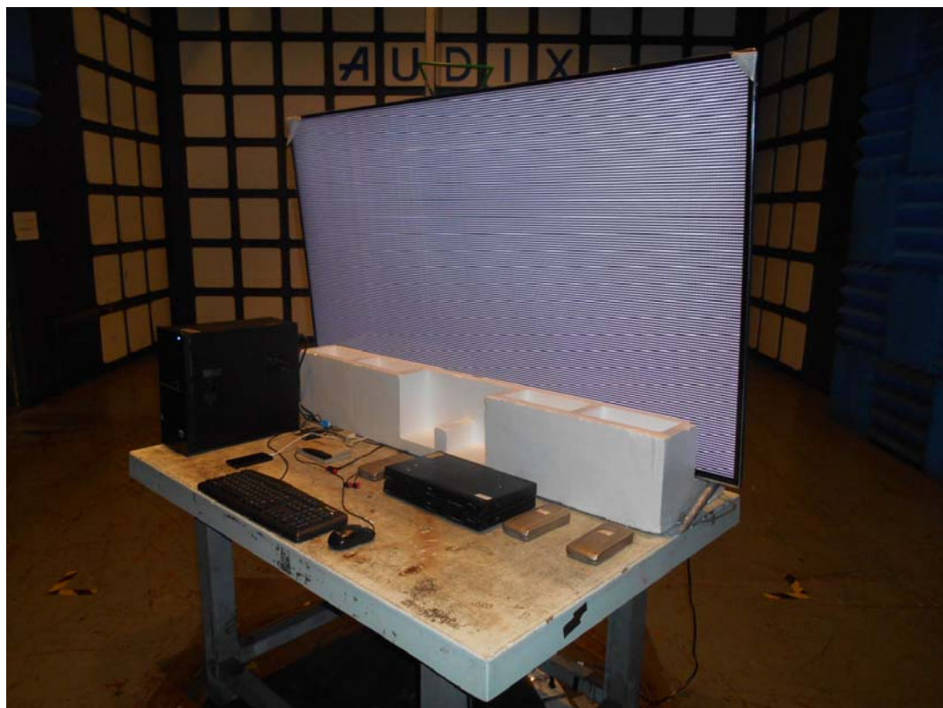
SETUP WITH MAXIMUM DETECTED EMISSION AT VERTICAL POLARIZATION (TEST MODE: HDMI 3840*2160@60Hz & 1KHz PLAYING)