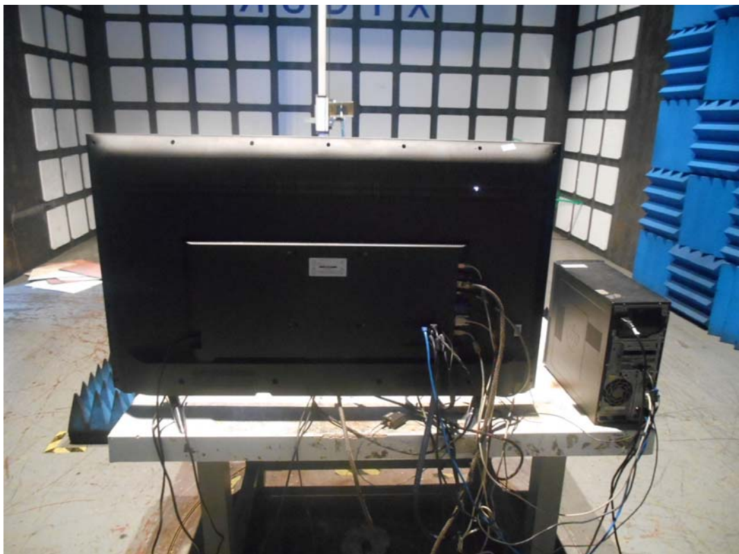
BACK VIEW OF RADIATED EMISSION TEST (ABOVE 1GHZ)