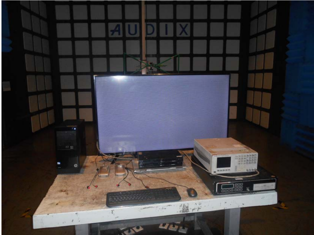
SETUP WITH MAXIMUM DETECTED EMISSION AT HORIZONTAL POLARIZATION (TEST MODE: HDMI 3840*2160@60Hz & 1kHz PLAYING)