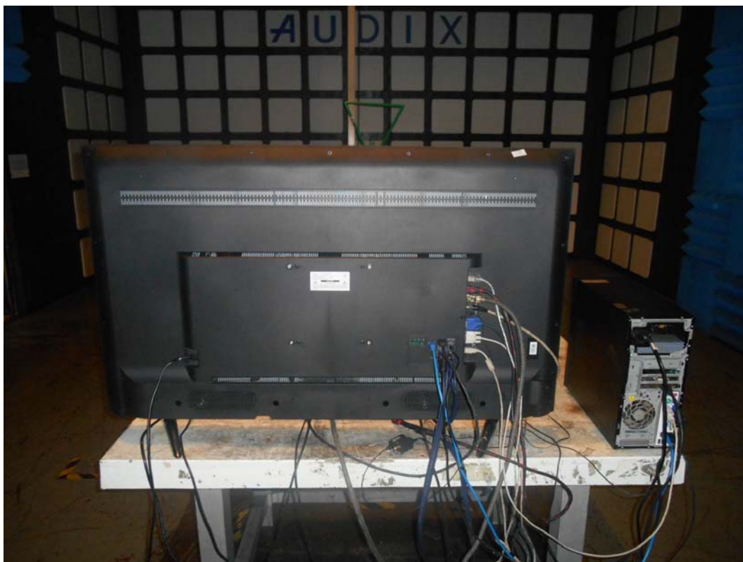
BACK VIEW OF RADIATED EMISSION TEST (BELOW 1GHZ)