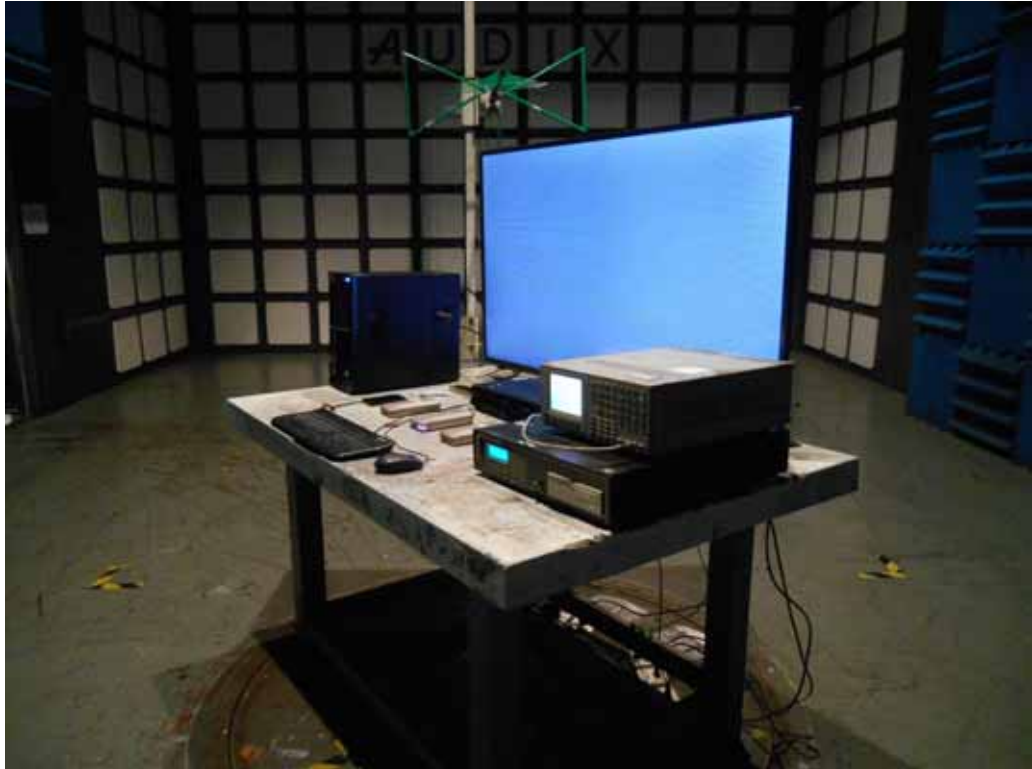
SETUP WITH MAXIMUM DETECTED EMISSION AT HORIZONTAL POLARIZATION (TEST MODE: HDMI 3840*2160@60HZ & 1KHZ PLAYING)