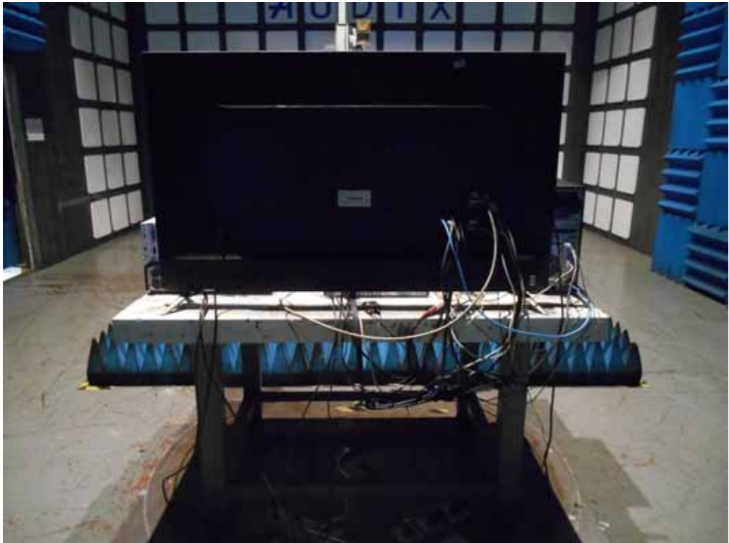
BACK VIEW OF RADIATED EMISSION TEST (ABOVE 1GHZ)