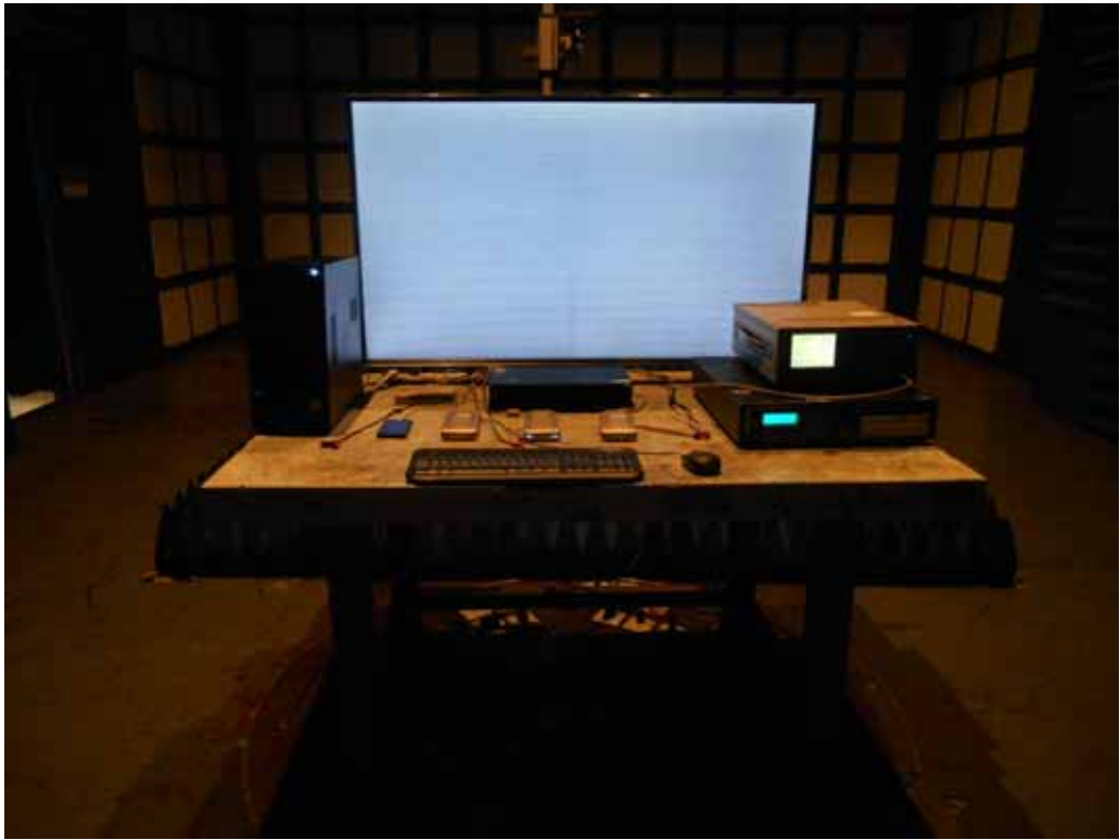
FRONT VIEW OF RADIATED EMISSION TEST (ABOVE 1GHZ)