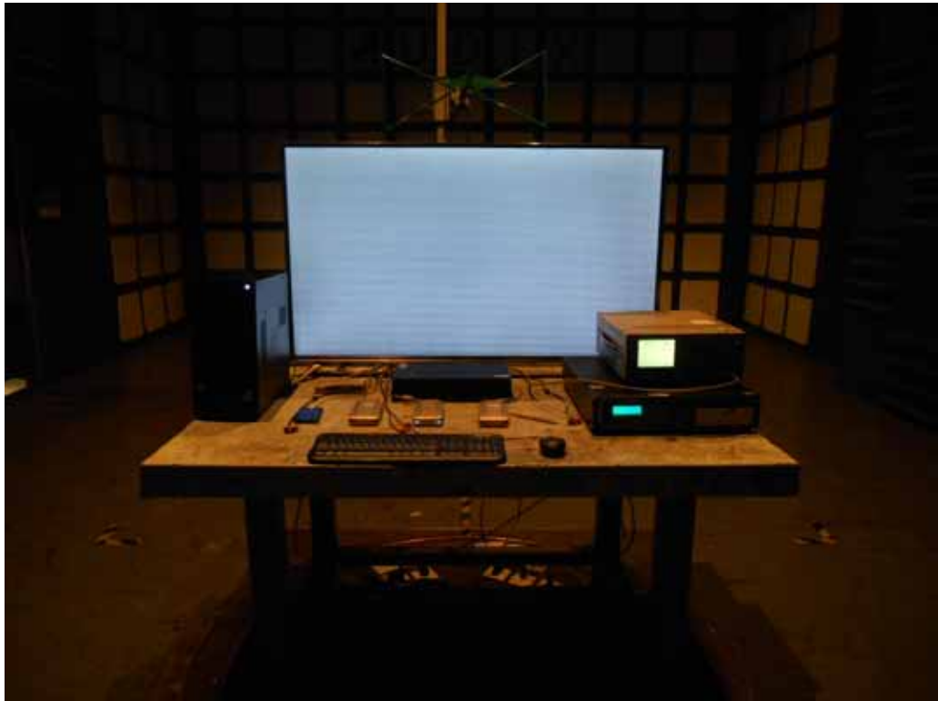
FRONT VIEW OF RADIATED EMISSION TEST (BELOW 1GHZ)