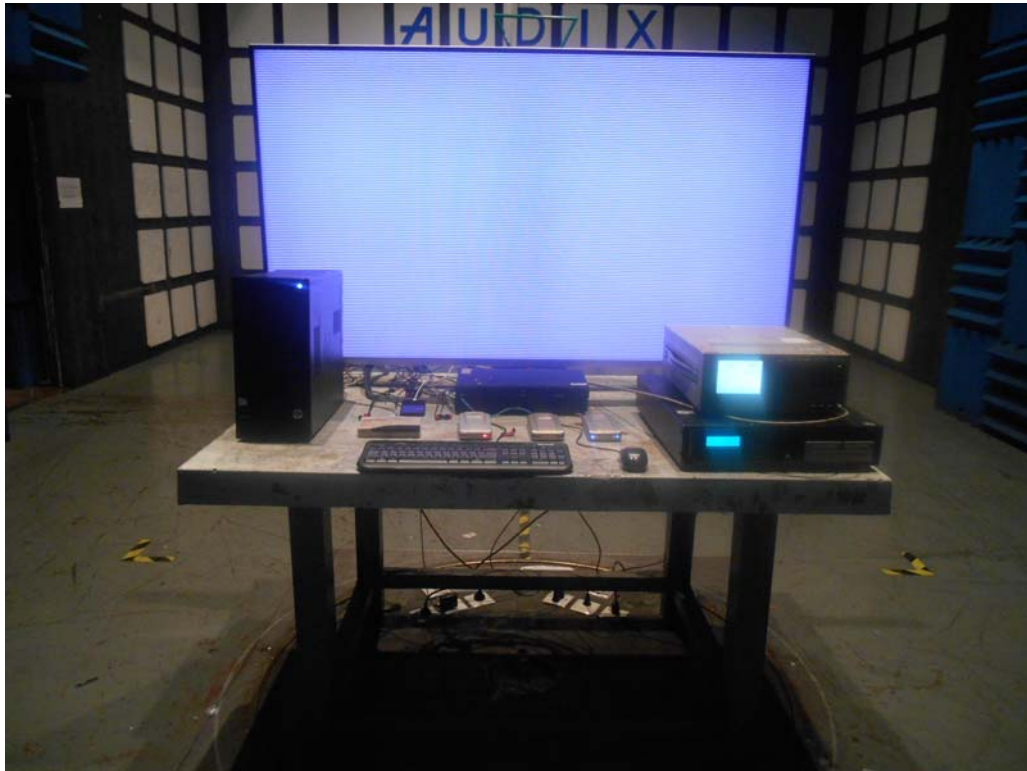
FRONT VIEW OF RADIATED EMISSION TEST (BELOW 1GHZ)