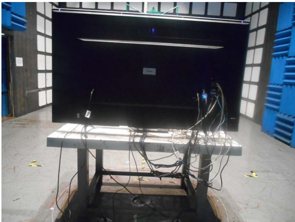
BACK VIEW OF RADIATED EMISSION TEST (BELOW 1GHZ)