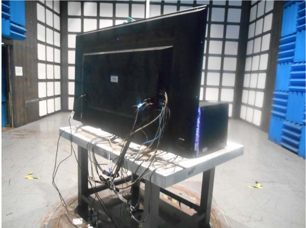
SETUP WITH MAXIMUM DETECTED EMISSION AT HORIZONTAL POLARIZATION (TEST MODE: HDMI1080P)