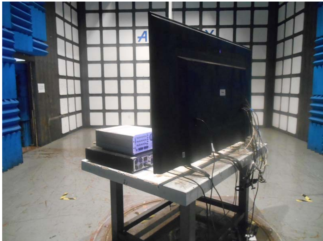
SETUP WITH MAXIMUM DETECTED EMISSION AT VERTICAL POLARIZATION (TEST MODE: HDMI1080P)