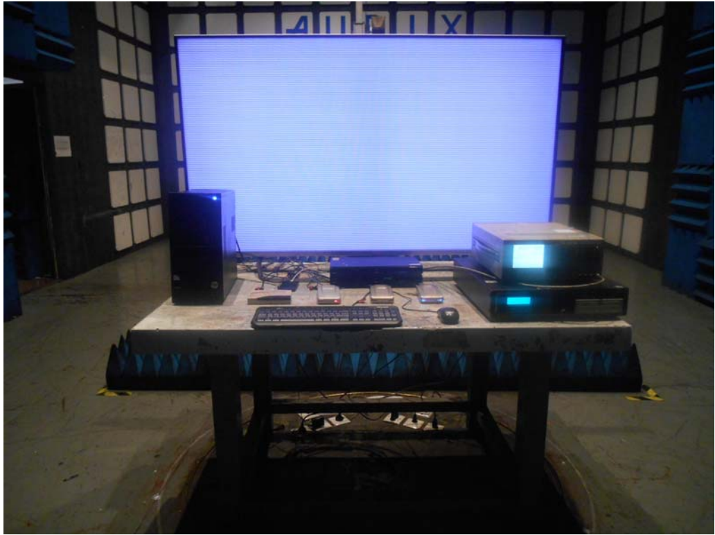
FRONT VIEW OF RADIATED EMISSION TEST (ABOVE 1GHZ)